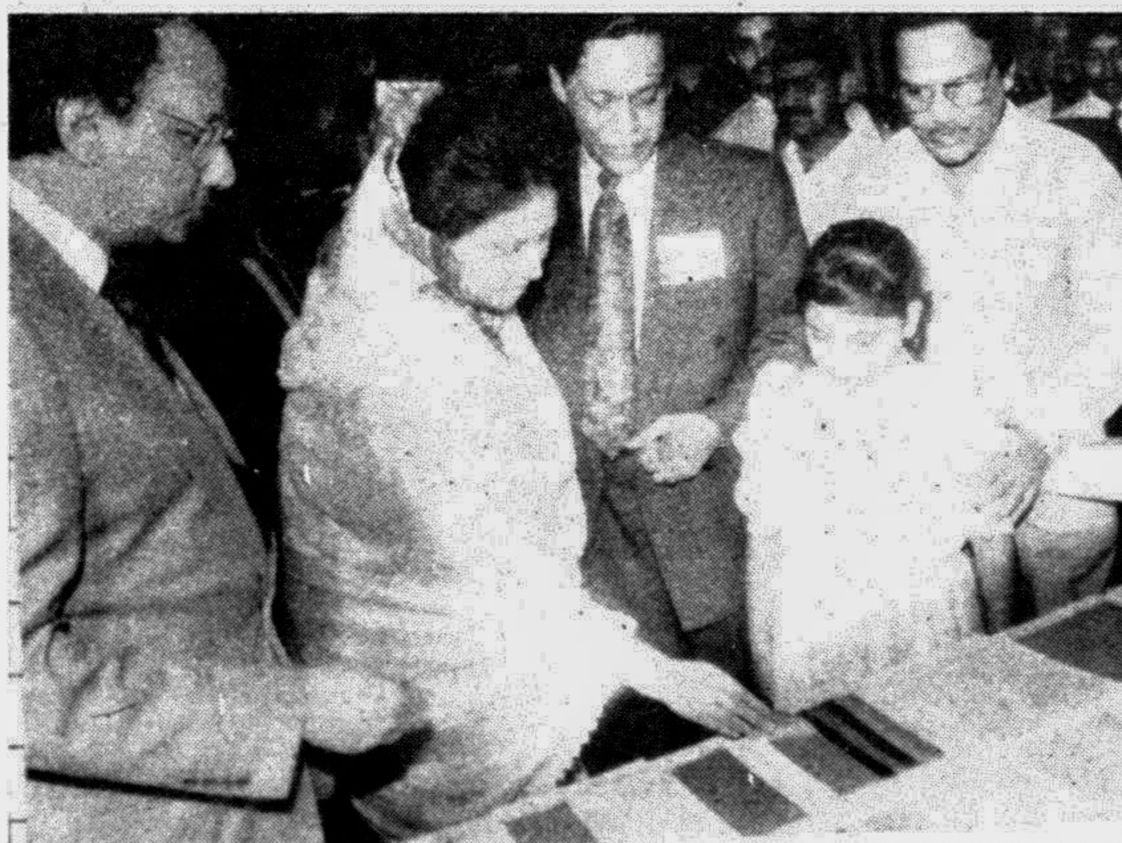
Prime Minister Begum Khaleda Zia visiting stalls after inaugurating the Bangladesh Apparel and Textiles Exposition '93 (BATEXPO-93) organised by the BGMEA in the city yesterday.

The inaugural function was addressed, among others, by Commerce Minister M K Anwar, State Minister for