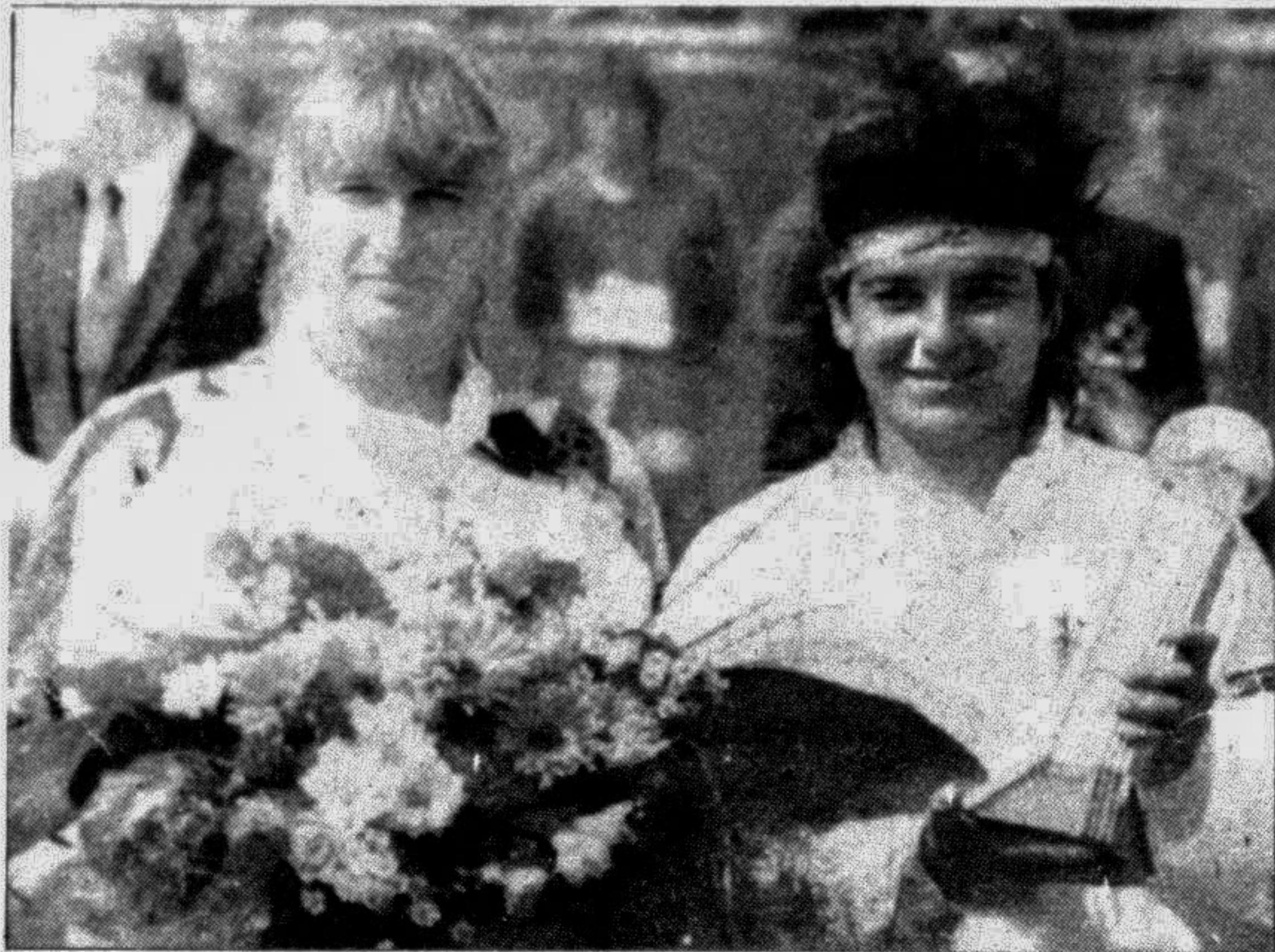
Spain's Arantxa Sanchez-Vicario (R) smiles while holding her trophy after beating world number two Steffi Graf of Germany 6-3, 6-3 in the final of the Hamburg Open tennis tournament on Sunday. Graf failed to become the first player to win a tournament seven times in a row.