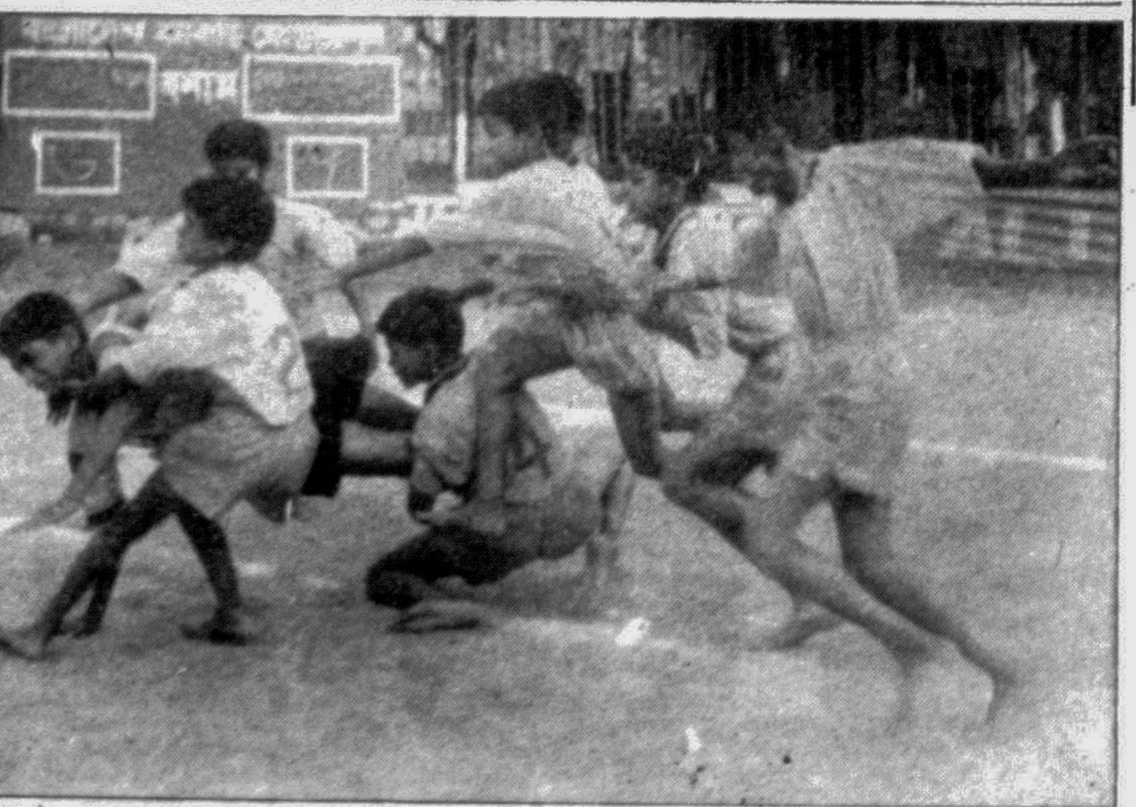
Action from the BGIC fourth schools kabaddi tournament match between Segun Bagicha High and Motijheel Model High at the Outer Stadium yesterday. Motijheel Model School won.

The Cryptoquip is a substitution cipher in which one letter stands for another. If you think that X equals O, it will equal O throughout the puzzle. Single letters, short words and words using an apostrophe give you clues to locating vowels. Solution is by trial and error.