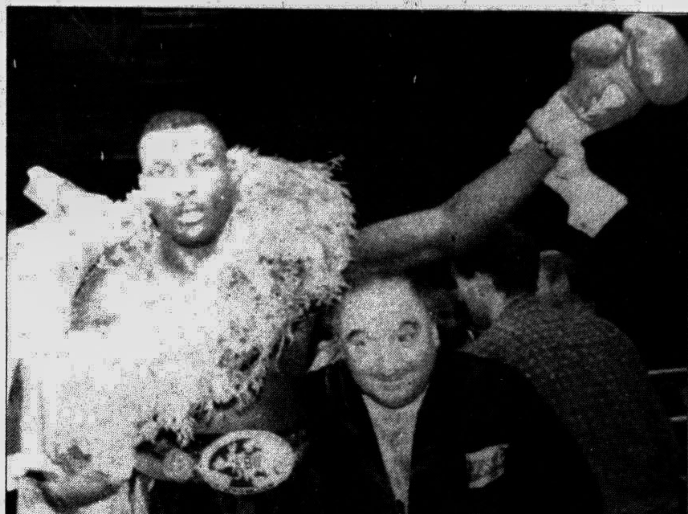
Briton Henry Akinwande rejoices after defeating German Axel Schultz to become new European heavyweight champion on Saturday.

Both the teams earned two losses each. Maniknagar Govt Primary School take on Notre Dame School while Gandaria High School meet Haider Ali High School in today's fixtures.