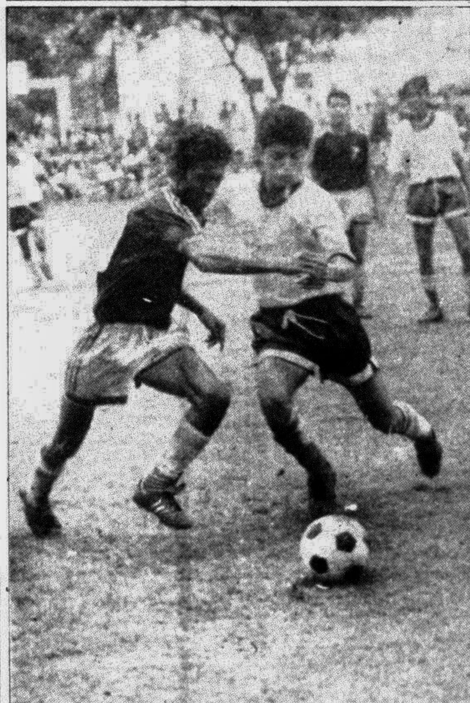
A midfield melee during the Janata Bank Pioneer soccer league Group A play-off between K R Boys Club and MSPCC at the Outer Stadium yesterday. K R Boys booked the last semifinal berth by winning the match 1-0.

The Green Delta Insurance First Division hockey league will resume Friday next at the Hockey Stadium. This was disclosed by the league committee in a meeting at the Bangladesh Hockey Federation office yesterday. After the inaugural match between defending champions Mohammedans and PWD on April 29, no matches could be held due to inclement weather. Abahani will take on Bangladesh Railway and Dhaka Mariner Youngs face Azad Sporting Club on Friday.