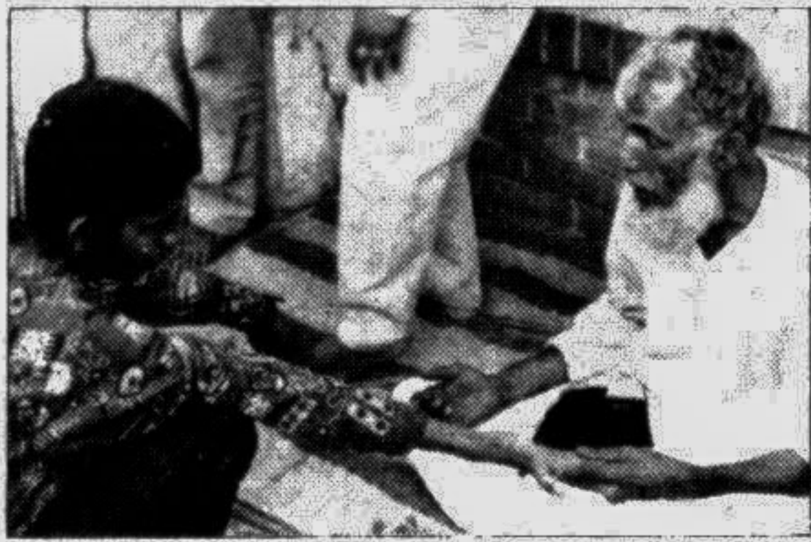
The fortune-teller has no answer to his own misfortune.

However, one single question remains unsolved, why does this man not use a stone to change his own fortune?