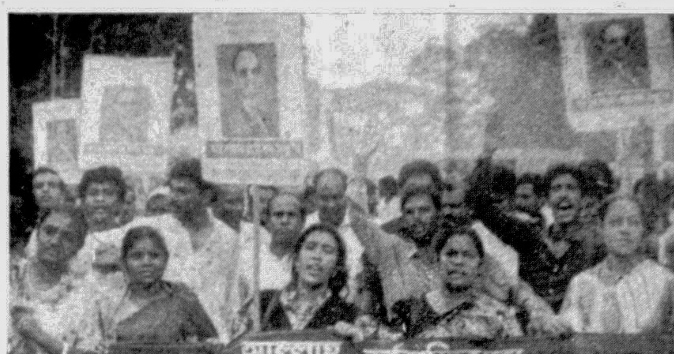
People of Bhandaria residing in Dhaka brought out a protest procession in the city demanding release of Anwar Hossain Manju, MP.

Two muggers were arrested in the capital yesterday as they tried to escape amid bomb blasts from a rickshaw passenger, reports UNB. Police said they robbed the rickshaw passenger of his belongings at danger point near Bangsal police outpost last evening and exploded bombs in a bid to get away.