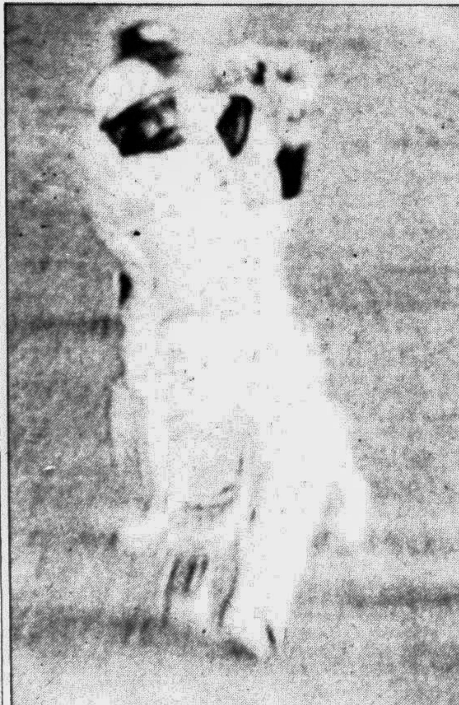
Pakistan's most experienced batsman Javed Miandad, playing his 120th Test, spells his own doom and that of his team in the second innings of the second Test at Bridgetown, Barbados on April 25. Having hit Carl Hooper's previous delivery in the last over of the third day Miandad only succeeded in hitting this one straight down deep mid-wicket fielder Keith Arthurton's throat after making 43.

Roma players Andrea Carnevale and Angelo Peruzzi were banned from soccer for 12 months in 1990 after testing positive for an amphetamine. Goalkeeper Peruzzi has since joined Juventus.