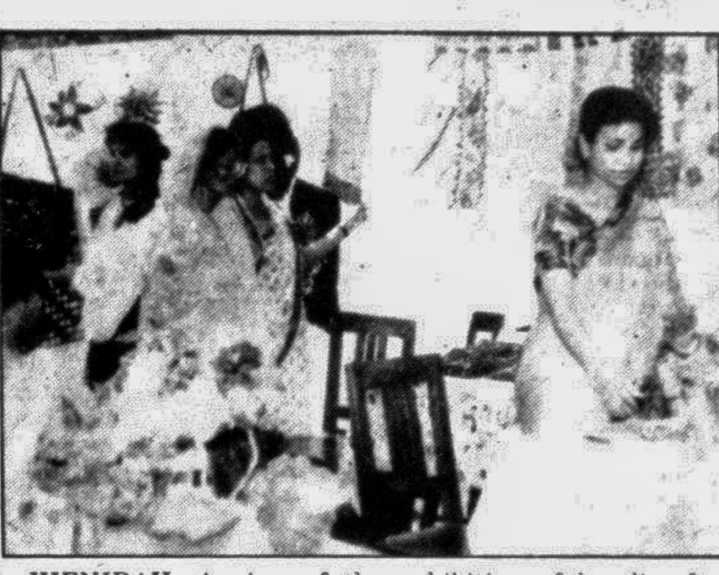
JHENIDAH: A view of the exhibition of handicrafts arranged here by the local Mahila Parishad recently.