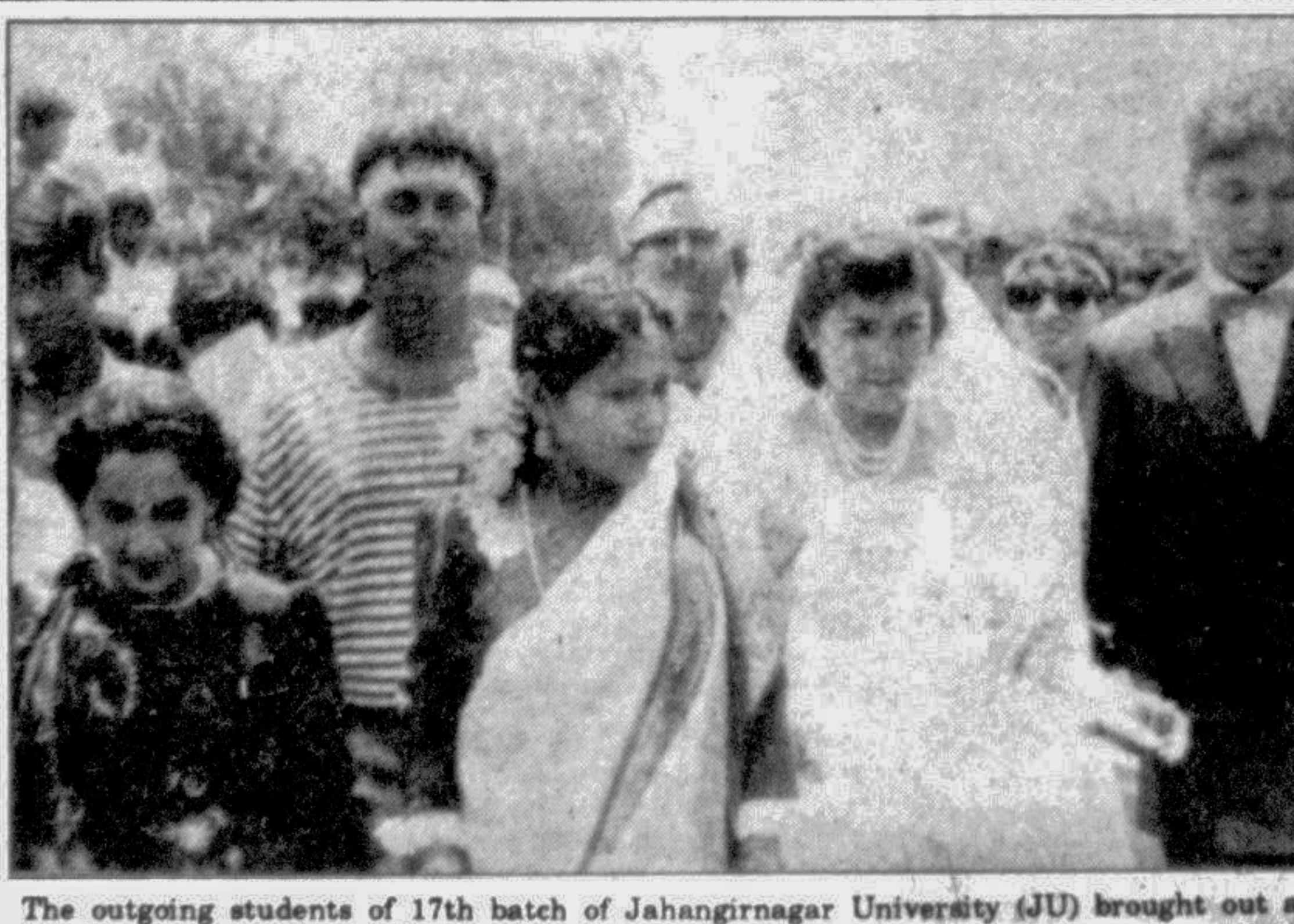
The outgoing students of 17th batch of Jahangirnagar University (JU) brought out a fashionable procession on the 'Rag Day' recently.

BARISAL, Apr 27: The Public Health Engineering Department will install 1,370 deep and 2,225 shallow tubewells at different places in three southern districts during the current financial year, reports UNB. The department has also fixed a target of sinking 153 deep pumps and resinking 1,753 shallow tubewells in Barisal, Patuakhali and Faridpur, official sources said. The projects are being implemented with the assistance of UNICEF. Meanwhile, 100 deep and 50 shallow tubewells have already been installed in the areas. Another BSS report says: The government has acquired 7.31 hectares of land to construct the divisional headquarters complex of newly established Barisal Division at Ichhakati, 5 kilometres from here, in the current fiscal year. According to an official source, the government has placed a budget of Taka 16,19,54,000/- for approval of the Ministry of Finance for implementation of the project. Superintending Engineer of Public Works Department (PWD) of Barisal circle told BSS that the project includes construction of 8,064 square metre four-storied commissioner's secretariat building, 656 square metre multipurpose hall, 381 square metre mosque and a guard room. Meanwhile, preliminary and engineering works on these project have been completed.