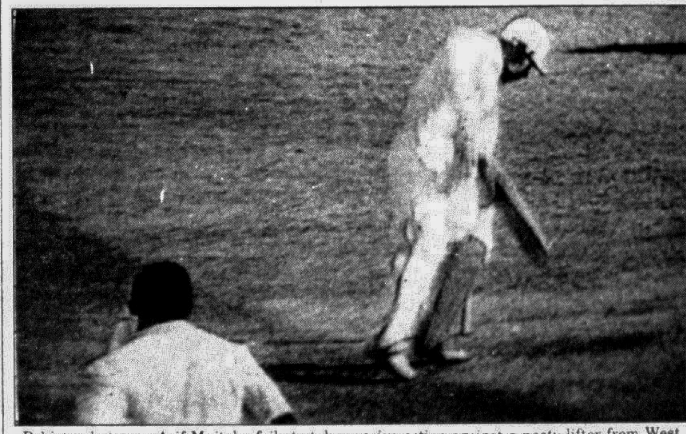
Pakistan batsman Asif Mujtaba fails to take evasive action against a nasty lifter from the West Indian paceman Courtney Walsh and is caught by Richardson (not in pic) after he grazed his glove and helmet during the first innings of the second cricket Test at Bridgetown Saturday. Mujtaba made 13.