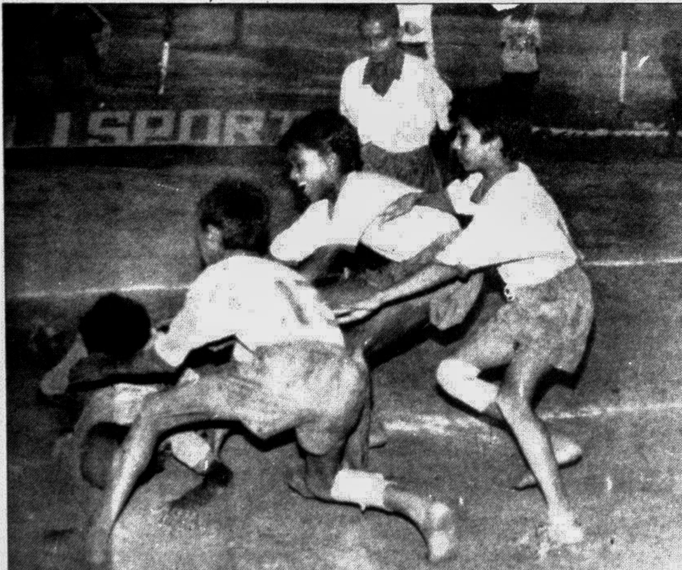
Action from yesterday's fourth schools kabaddi competition match between Gandaria High School and Maniknagar Primary School at the Outer Stadium kabaddi court. Gandaria won 19-17.