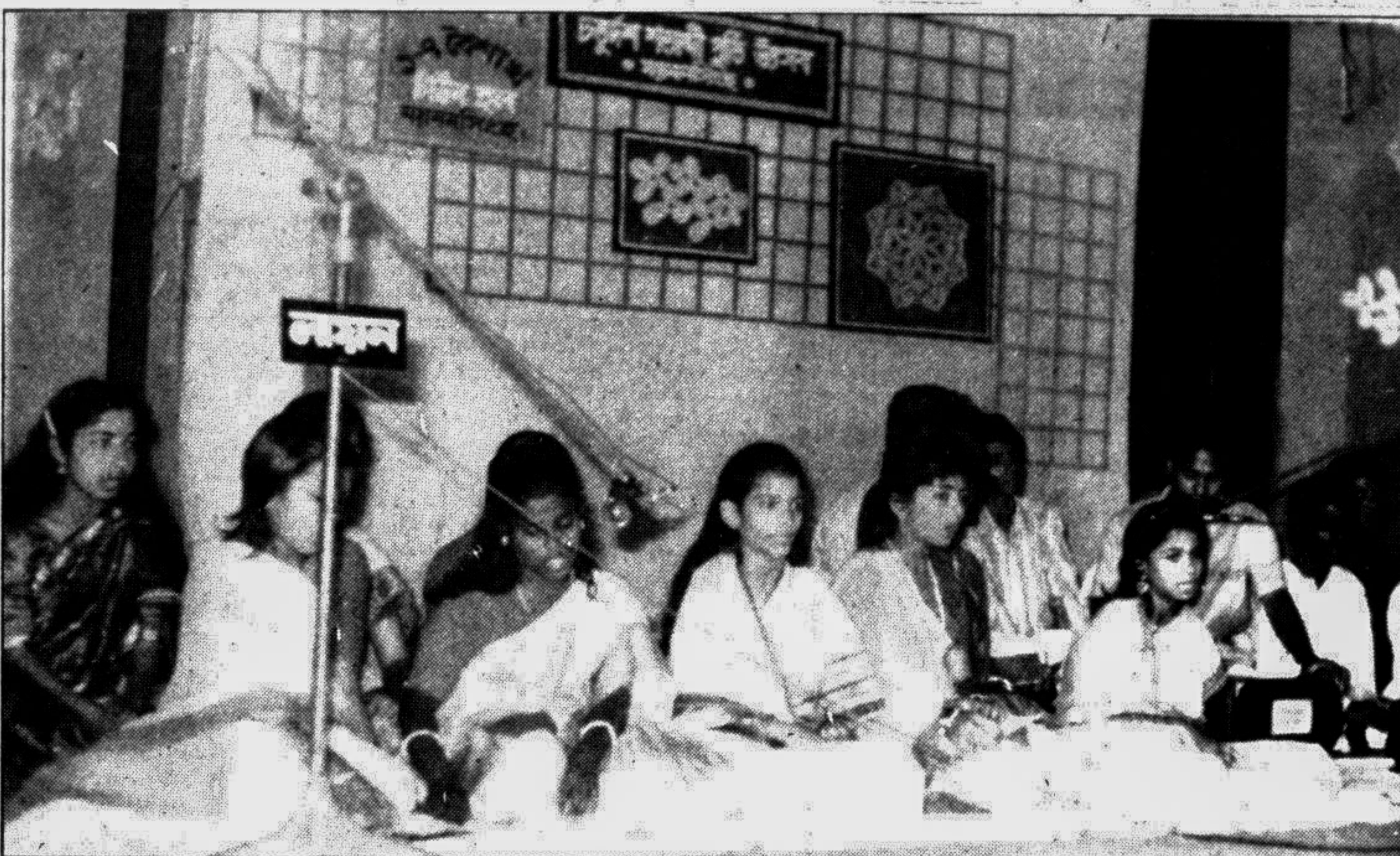
MYMENSINGH: Local artistes are seen rendering songs at a function arranged by the local administration on the occasion of Pabela Baishakh.

Eye-witnesses said property including foodgrains and household articles worth lakhs of Taka gutted in the fire. Cause of the fire could not be ascertained.