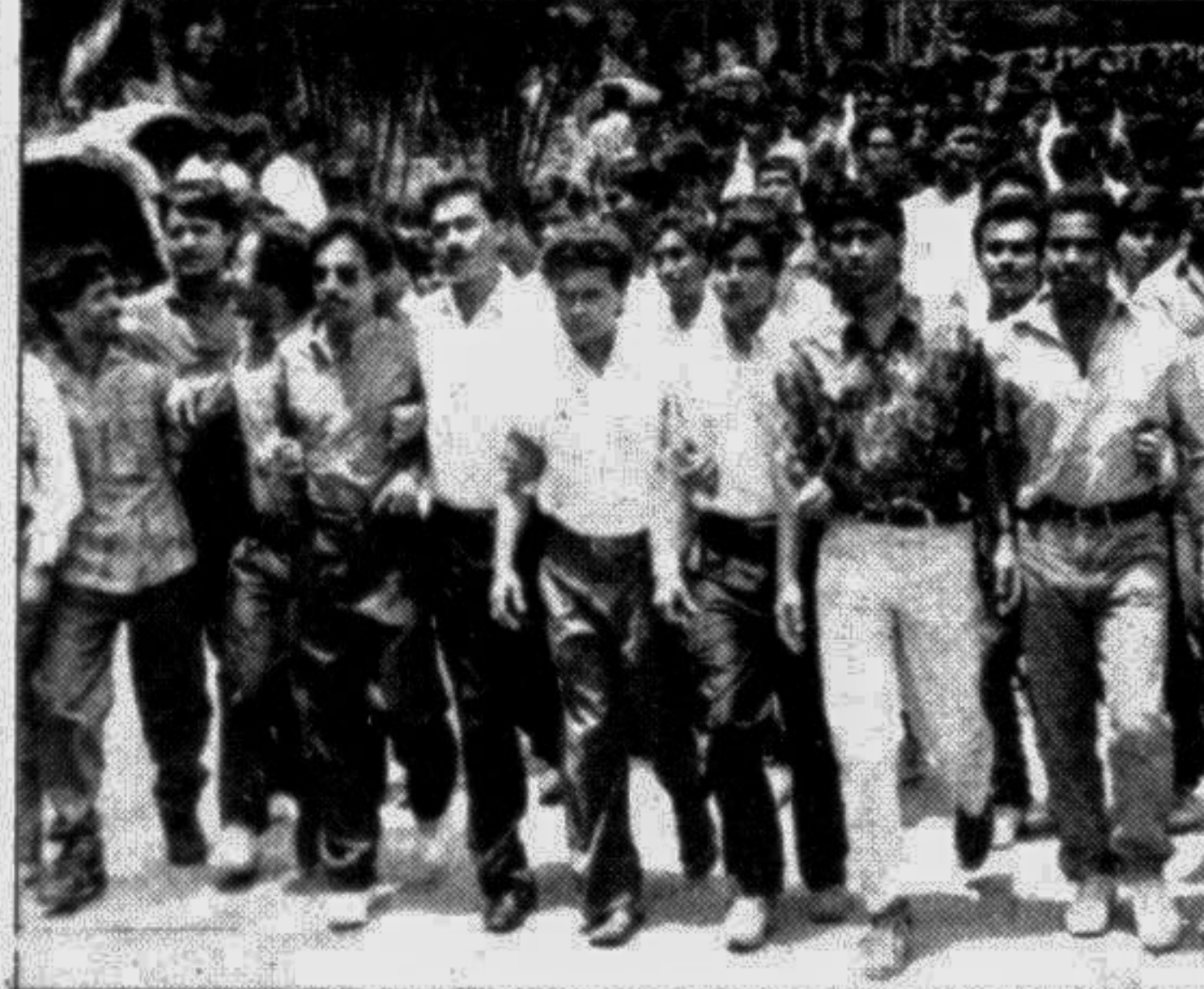
Bangladesh Chhatra League (M-I) brought out a procession on the campus yesterday in protest against police action during Nirmul body's sit-in programme Sunday.

The camp has facilities for boarding, health and prayer, volunteers of the Ministry of Religious Affairs is in overall charge of supervision of the Hajj Camp.