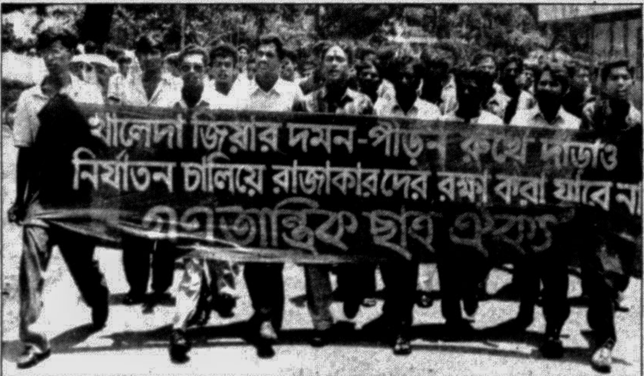
Procession of Ganatantrik Chhatra Oikya on the campus yesterday.