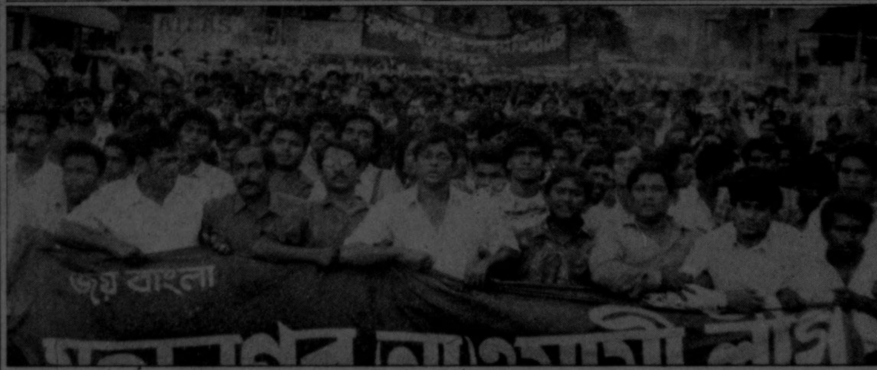
All party meeting at Bangabandhu Avenue (top) and procession in city yesterday protesting police assault on Nirmul Committee activists Sunday.