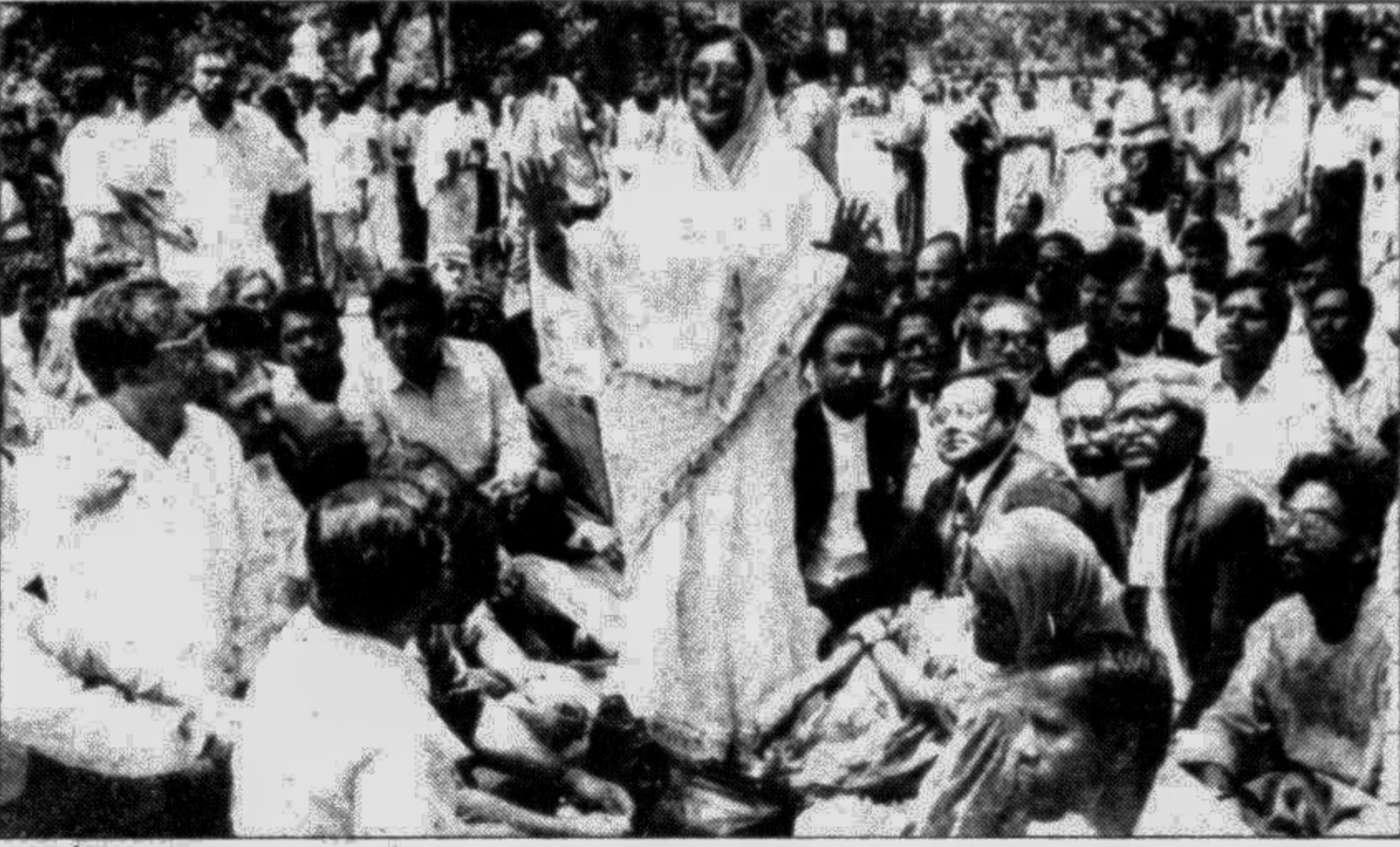
Jahanara Imam addressing a rally in front of Ministry of Foreign Affairs during yesterday's sit-in. Story on Page 1

Youths urged to resist terrorism By Staff Correspondent The Mayor of Dhaka City Corporation, Mirza Abbas Sunday called upon the youth to build themselves up as worthy citizens of the country. He was speaking as the chief guest at a discussion meeting organised by Motijheel T&T College to observe Bengali year 1400. He laid stress on government's pledge to keep the educational institutions free of violence and urged the students to resist any kind of terrorism.