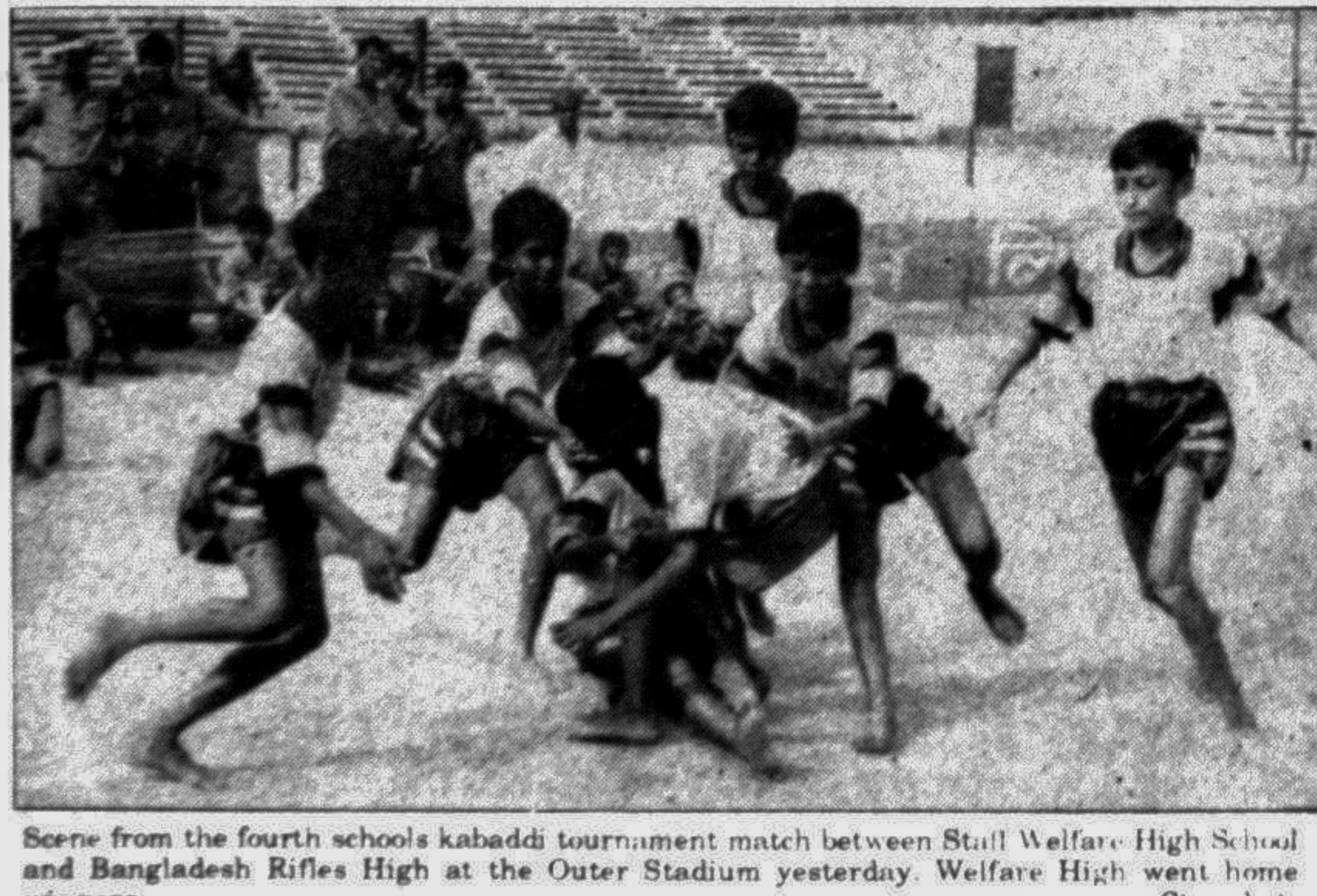
Scene from the fourth schools kabaddi tournament match between Staff Welfare High School and Bangladesh Rifles High at the Outer Stadium yesterday. Welfare High went home winners.