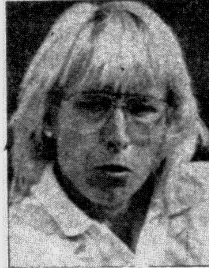
MARTINA NAVRATILOVA Davis Cup and their replacements were eliminated by Australia in the first round last month. Now the marquee women are unavailable for this summer's Federation Cup.

NEW YORK, Apr 24: Putting together a high-profile tennis team to represent the United States in international competition is no easy task these days, reports AP.