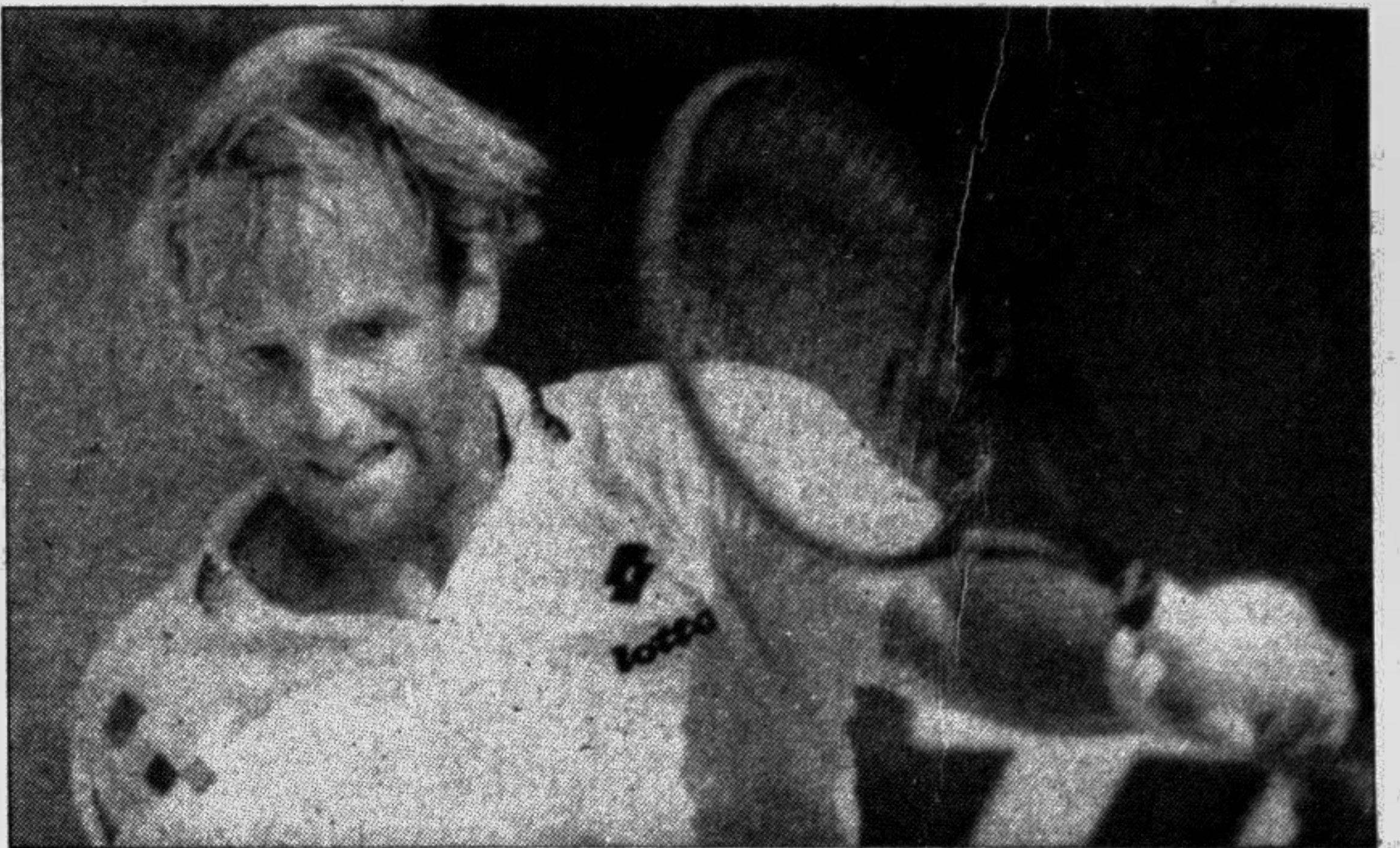
Thomas Muster of Austria makes a backhand return to Spaniard Alex Corretja during their match in the Monte Carlo Open on Friday. Muster won the match 6-2, 6-2 to move into the semifinal where he bowed down to another Spaniard, Sergi Bruguera, 6-4, 1-6, 7-6.

DORTMUND, Germany, Apr 24: An undermanned German team beat Finland 3-1 Friday to take the lead in pool B in the World Hockey Championships, reports AP.