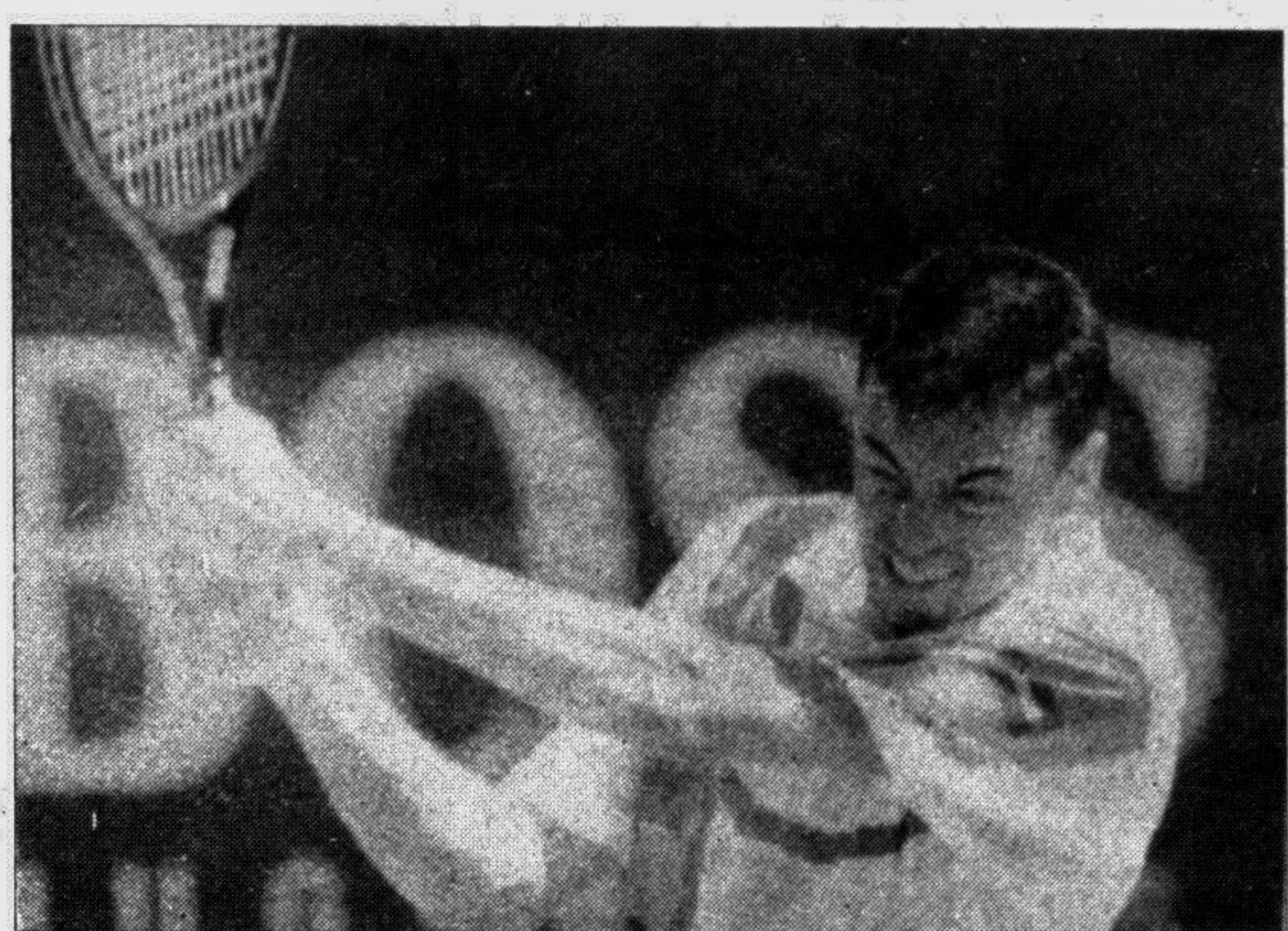
Spaniard Sergi Bruguera makes a double-fisted backhand return during his third round encounter against Czech-born American Ivan Lendl in the Monte Carlo Open tennis tournament on Thursday...