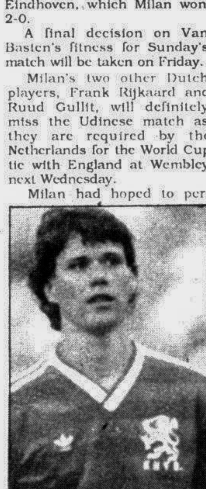
MARCO VAN BASTEN