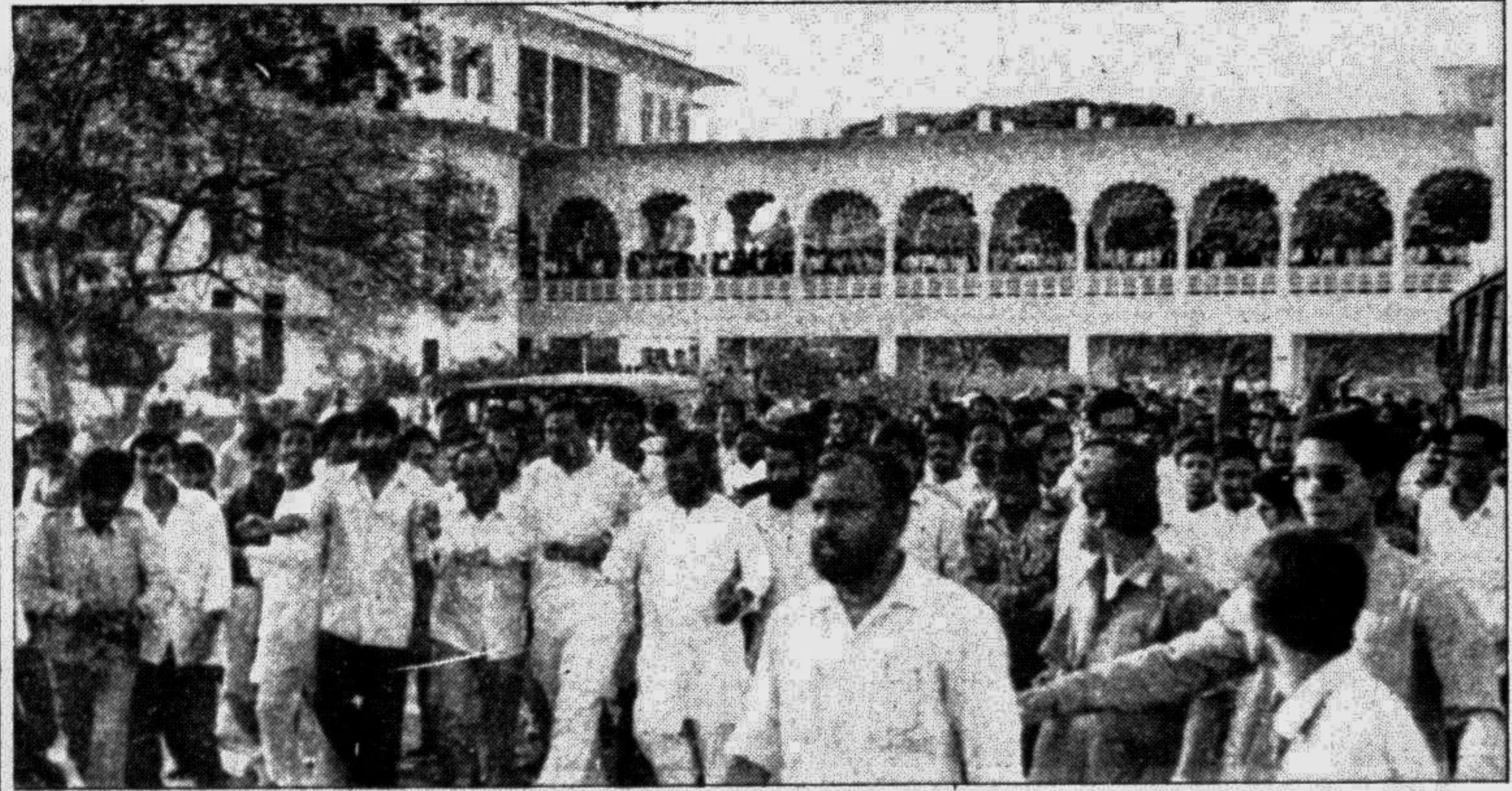
Supporters of Jamaat-e-Islami Bangladesh coming out of the High Court premises yesterday after the verdict of Golam Azam's citizenship case.

He was held under the Special Powers Act and given 120 days detention.