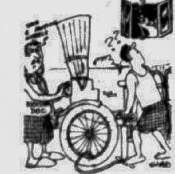
The Rickshaw Healers Page 3