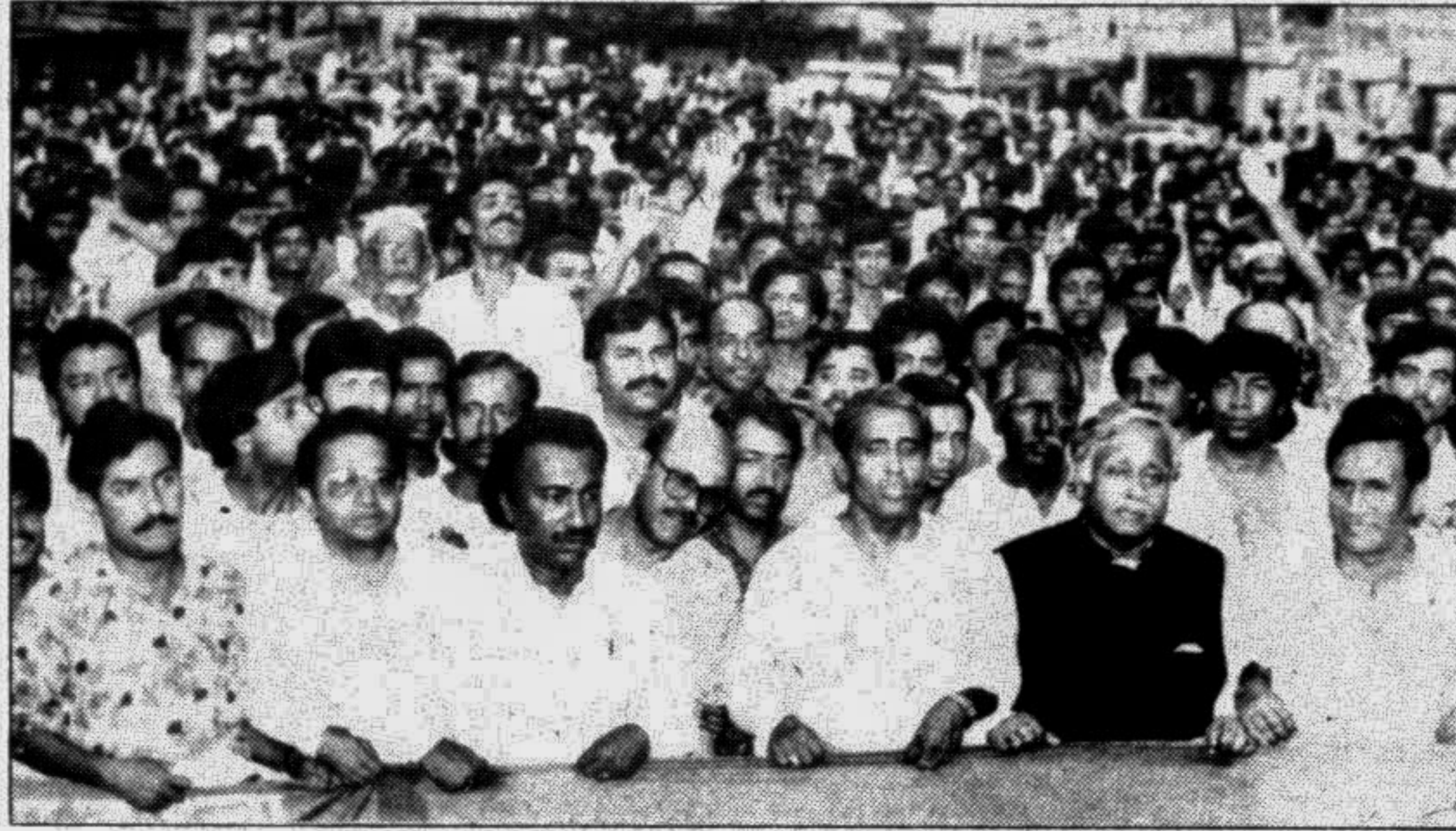
Awami League city unit brought out a procession yesterday in support of April 25 programme of the Nirmul Samannay Committee.

By Staff Correspondent CHITTAGONG, Apr 21: Custom officials and Navy personnel today impounded a Vietnam flag carrier at the outer anchorage of the port here for carrying smuggled goods. According to official sources, the ship 'Flying Dragon' was cordoned off and the contraband including electronic goods and liquor were seized. The vessel that arrived here with a cargo of 14000 tons of cement via Singapore port came under anti-smuggling crackdown at the outer anchorage of Chittagong Port, sources added.