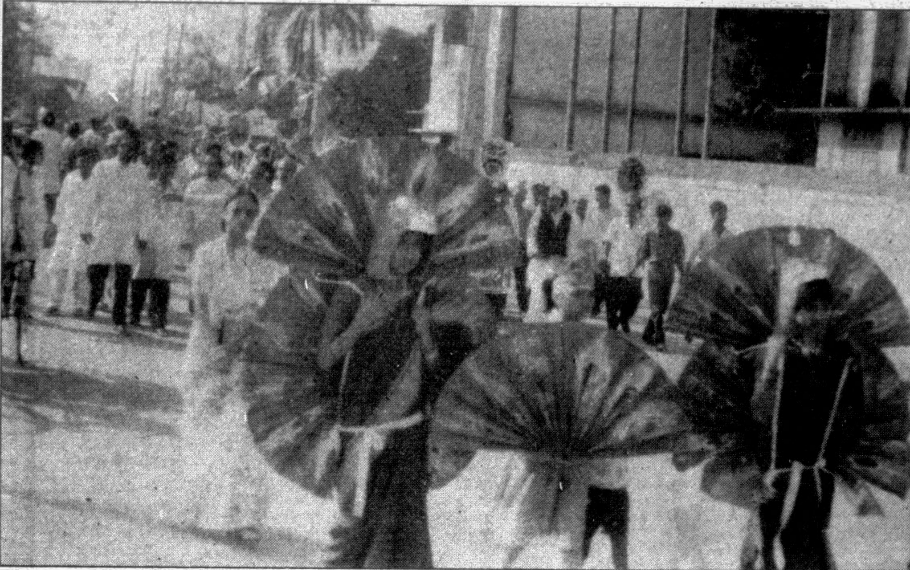
MYMENSINGH: A colourful procession was brought out at the town on the occasion of Pahela Baishakh under the joint auspices of district administration and combined cultural organisations.