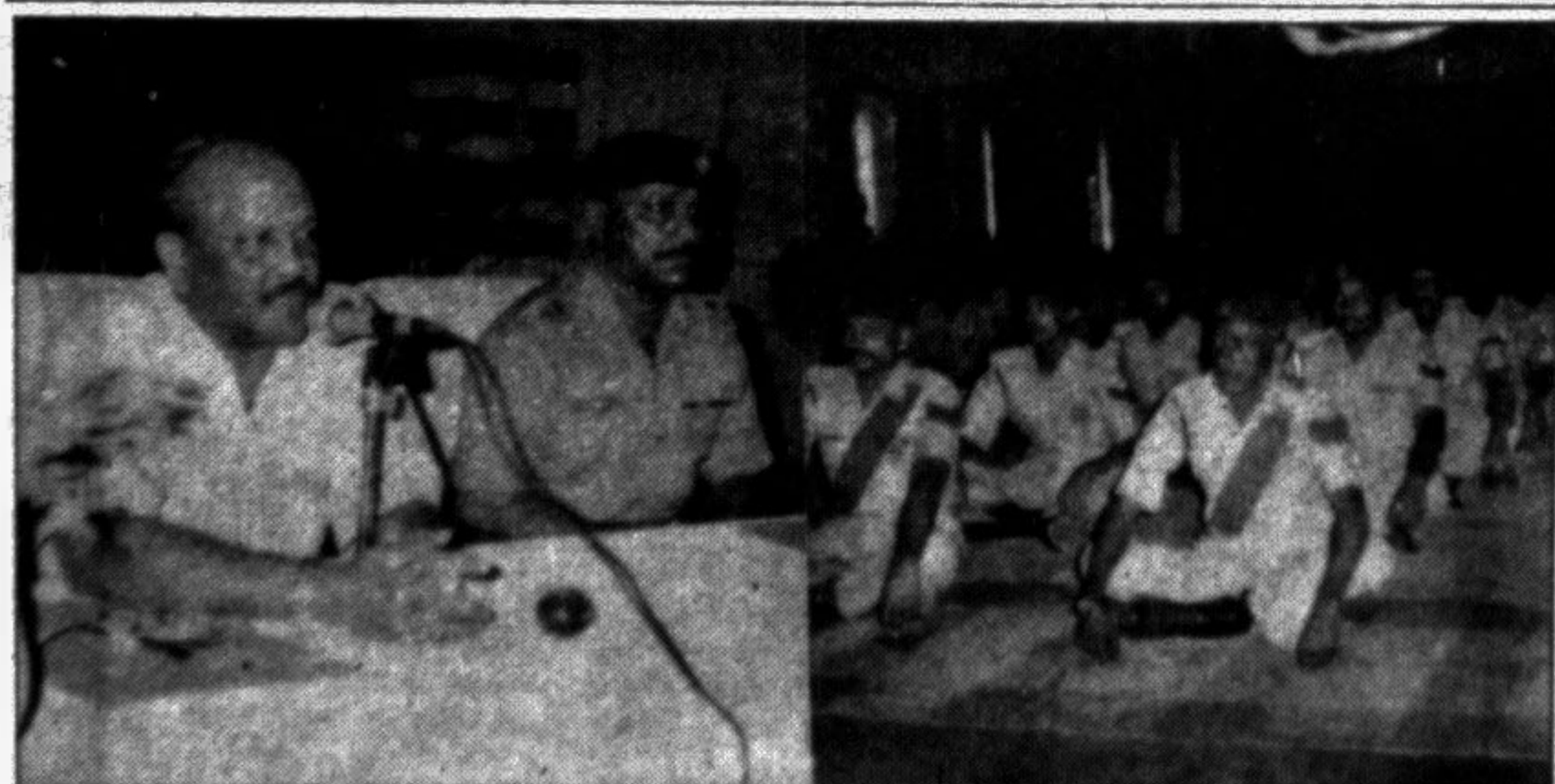
RANGPUR: Mirza Rokibul Huda, DIG of Police, Rajshahi Range is seen speaking at the gathering of the police constables at the auditorium of Rangpur Police Training Institute recently.

Pure mustard and coconut oil are not available in the market. The pourashava authorities and the health department are indifferent of their respective duties to check adulteration.