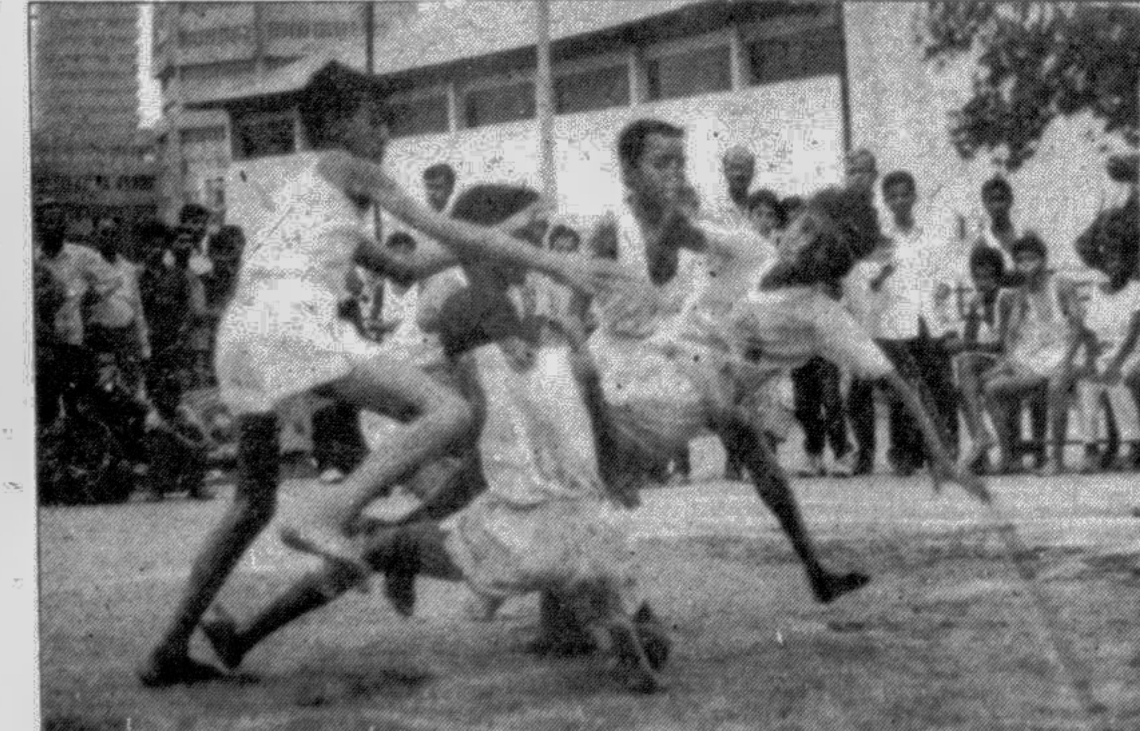
Action from yesterday's fourth schools kabaddi competition match between Dipshikha Biddalaya and Kamalapur High School at the Outer Stadium Kabaddi court. Kamalapur won 45-27.