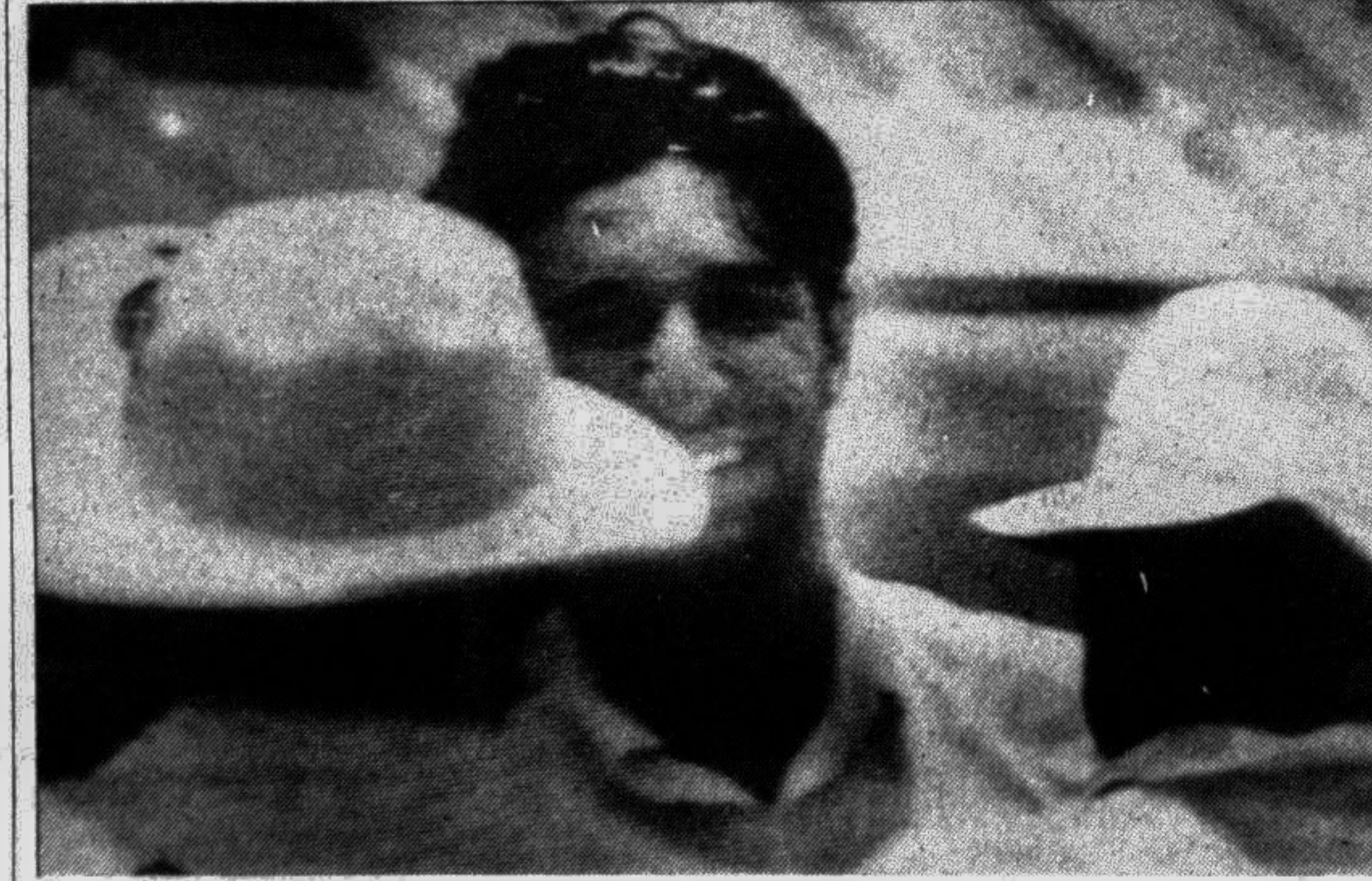
Teammates running up to congratulate a beaming Wasim Akram, after the Pakistani skipper took a brilliant catch to dismiss his counterpart Richie Richardson in the West Indies' second innings on Saturday.