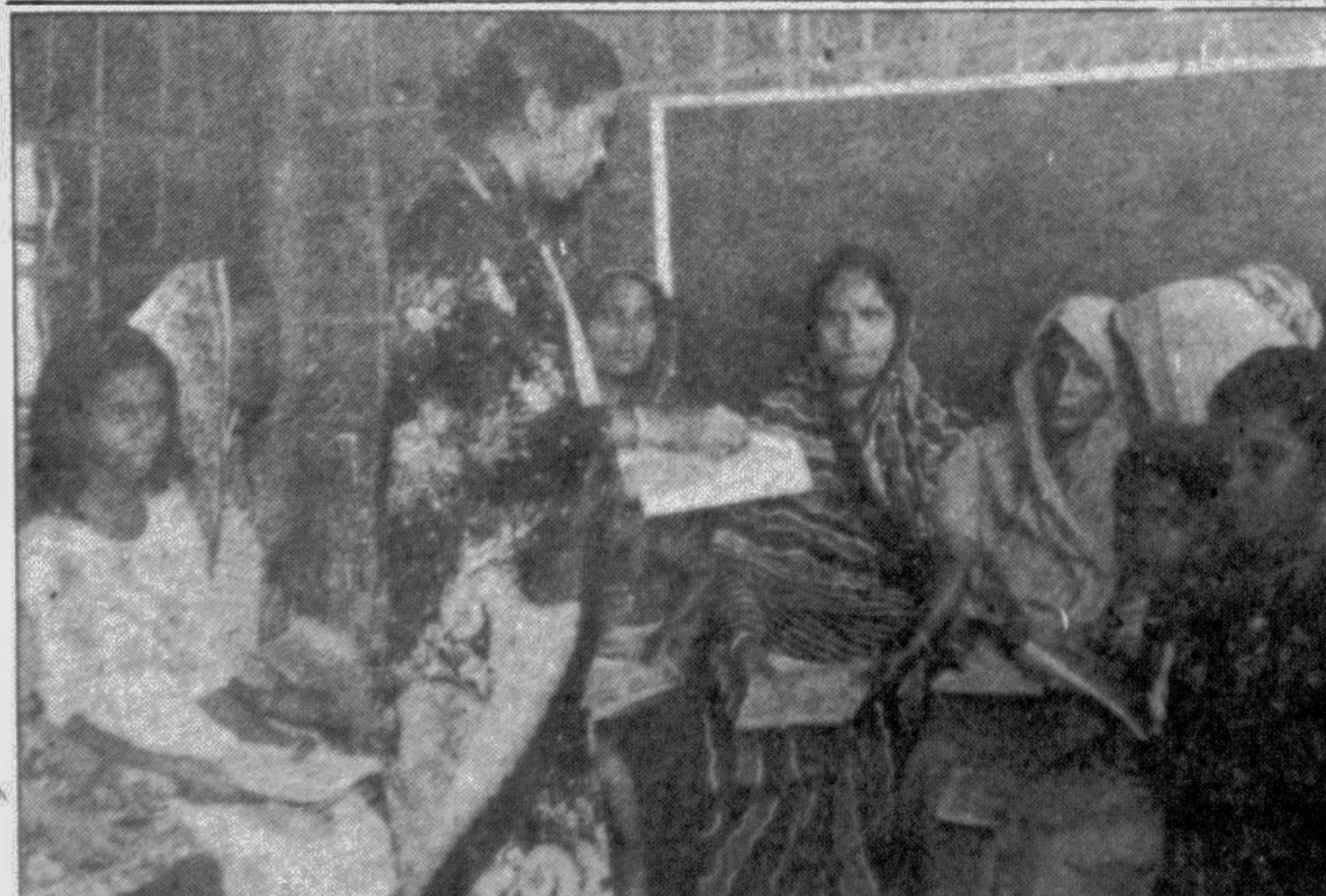
RANGPUR: The teacher and the students at a Gono-Shiksha Kendra (Mass Literacy Centre) at Tajhat of the district. The centre is run by local UNESCO club.

Later she was rushed to the local hospital where the doctors declared her dead. Police sent the body to morgue for autopsy.