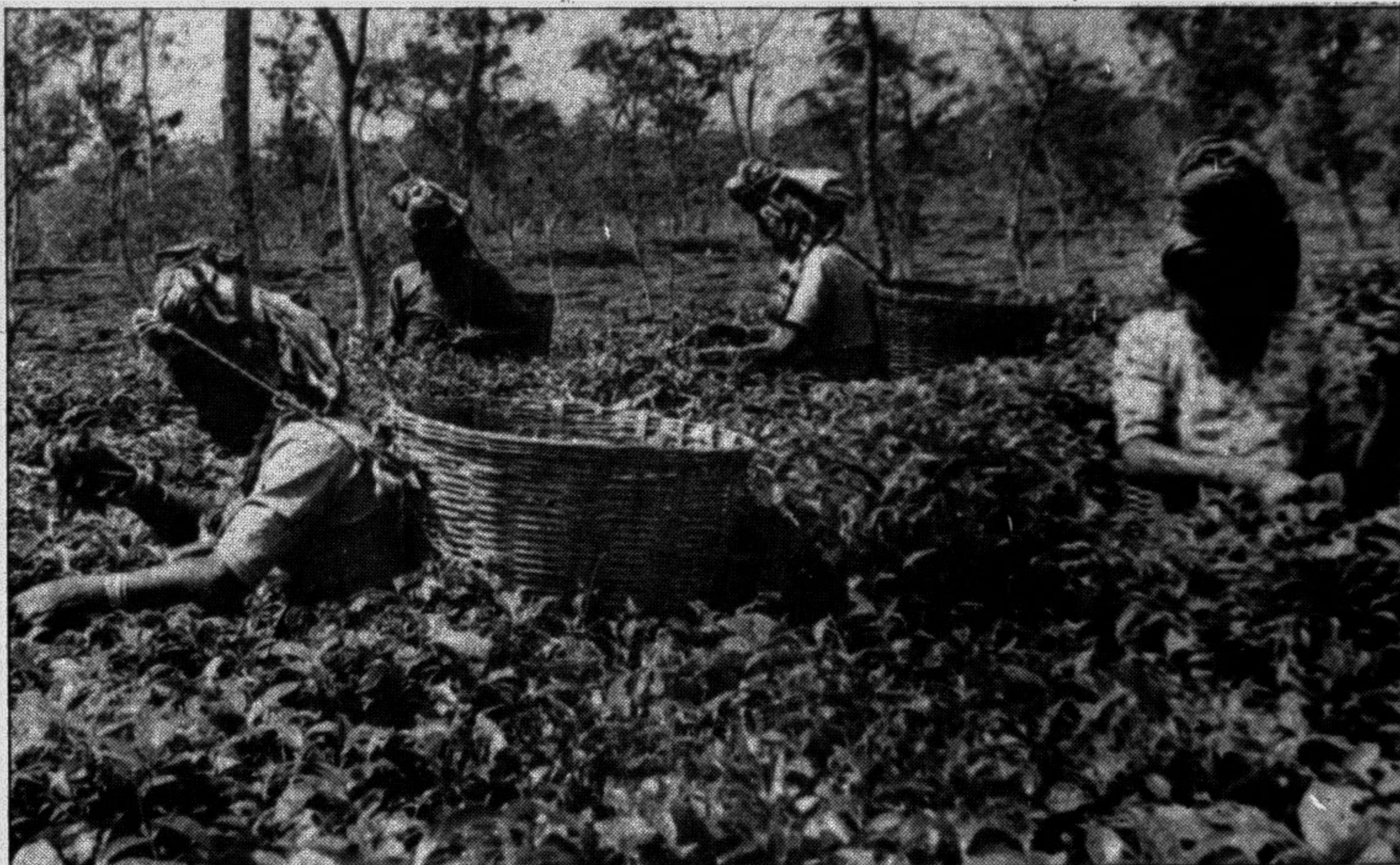
PLUCKING TEA-LEAVES: The women labourers are seen collecting tea-leaves at a garden in Srimongal, Bangladesh

According to a police press release, Jamil Hossain, has been hiding for quiet long time after his conviction in the arm case. During his hiding, he was found involved in several criminal activities.