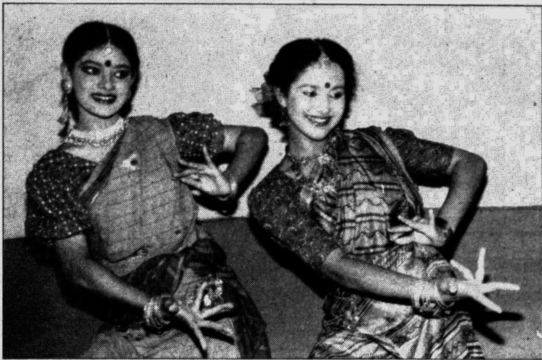
Two girls performing dance on the Ramna Green ground as part of JASSAS programme to welcome Bangla year 1400 in the city yesterday.