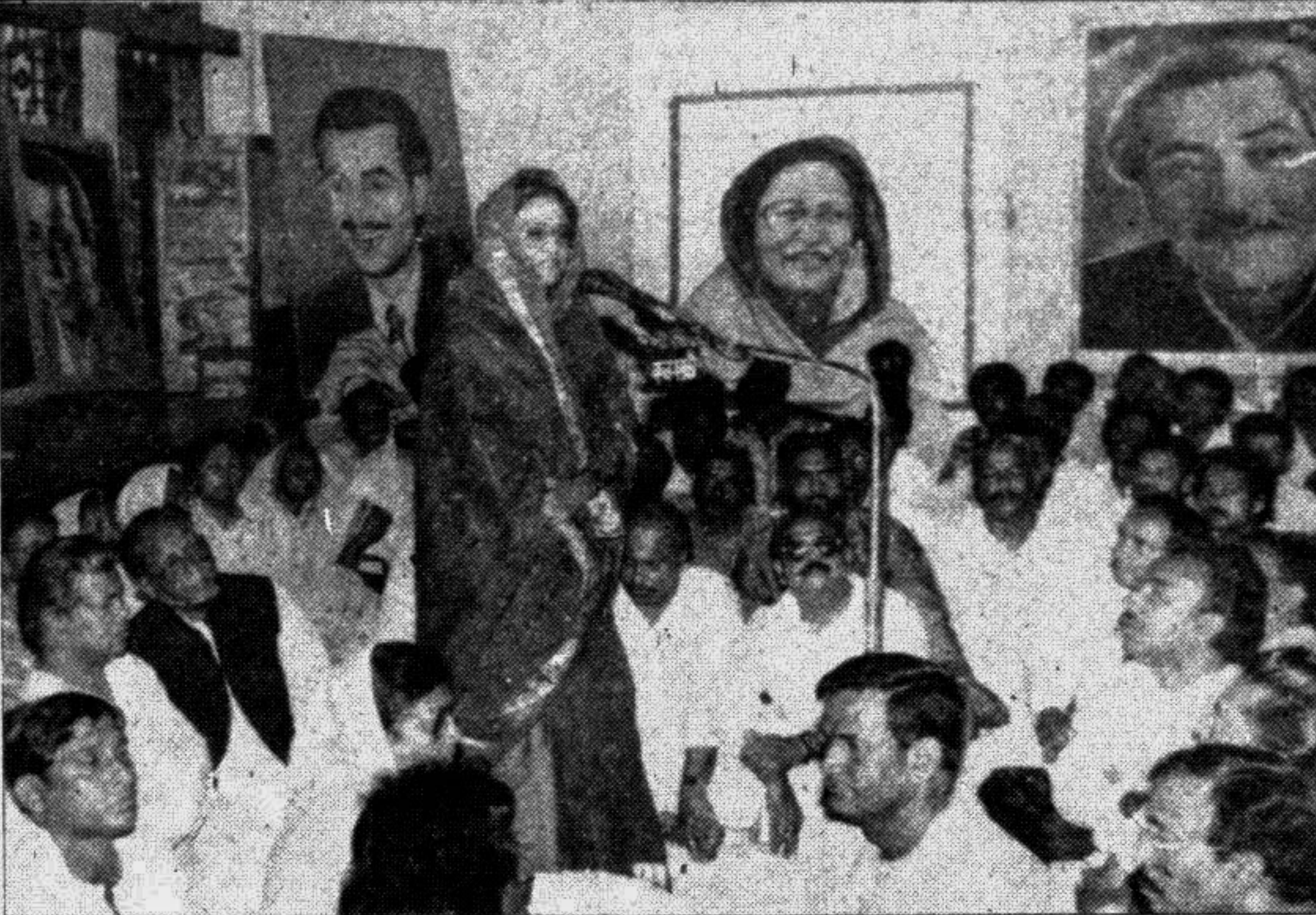
Sheikh Hasina addressing a discussion meeting on Mujibnagar Day at the Awami League central office yesterday.

A group of people yesterday (Saturday) caught red-handed four snatchers in front of RAJUK Bhaban in the city and handed them over to police, reports UNB.