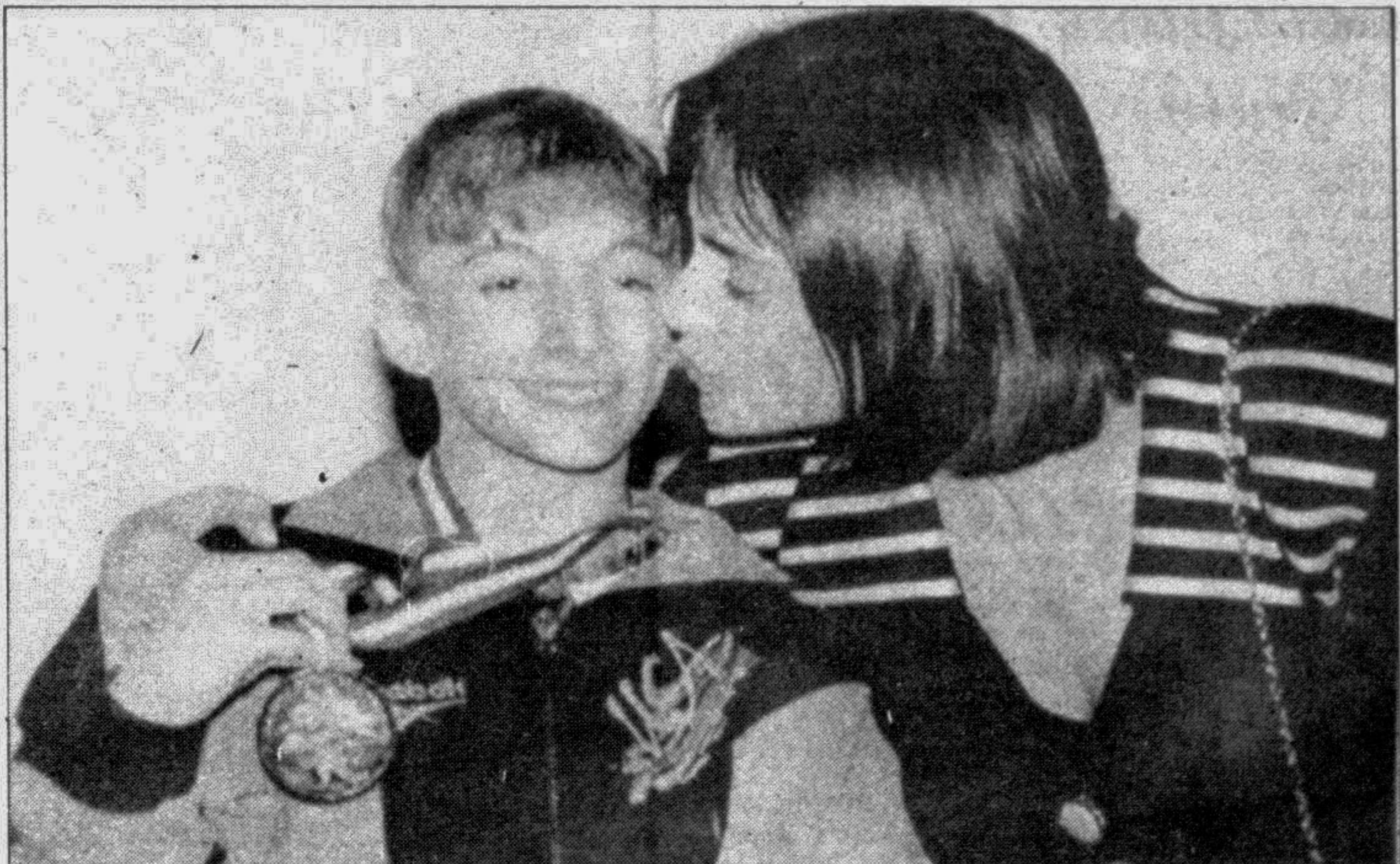
Nadia Comaneci, the Romanian who dazzled the gymnastics world with her brilliant performances in the Montreal Olympic Games in 1976, congratulates American Shannon Miller after the latter won the women's all-around individual event in the World championships in Birmingham on April 16.

The Bangladesh team will return home towards the end of this month.