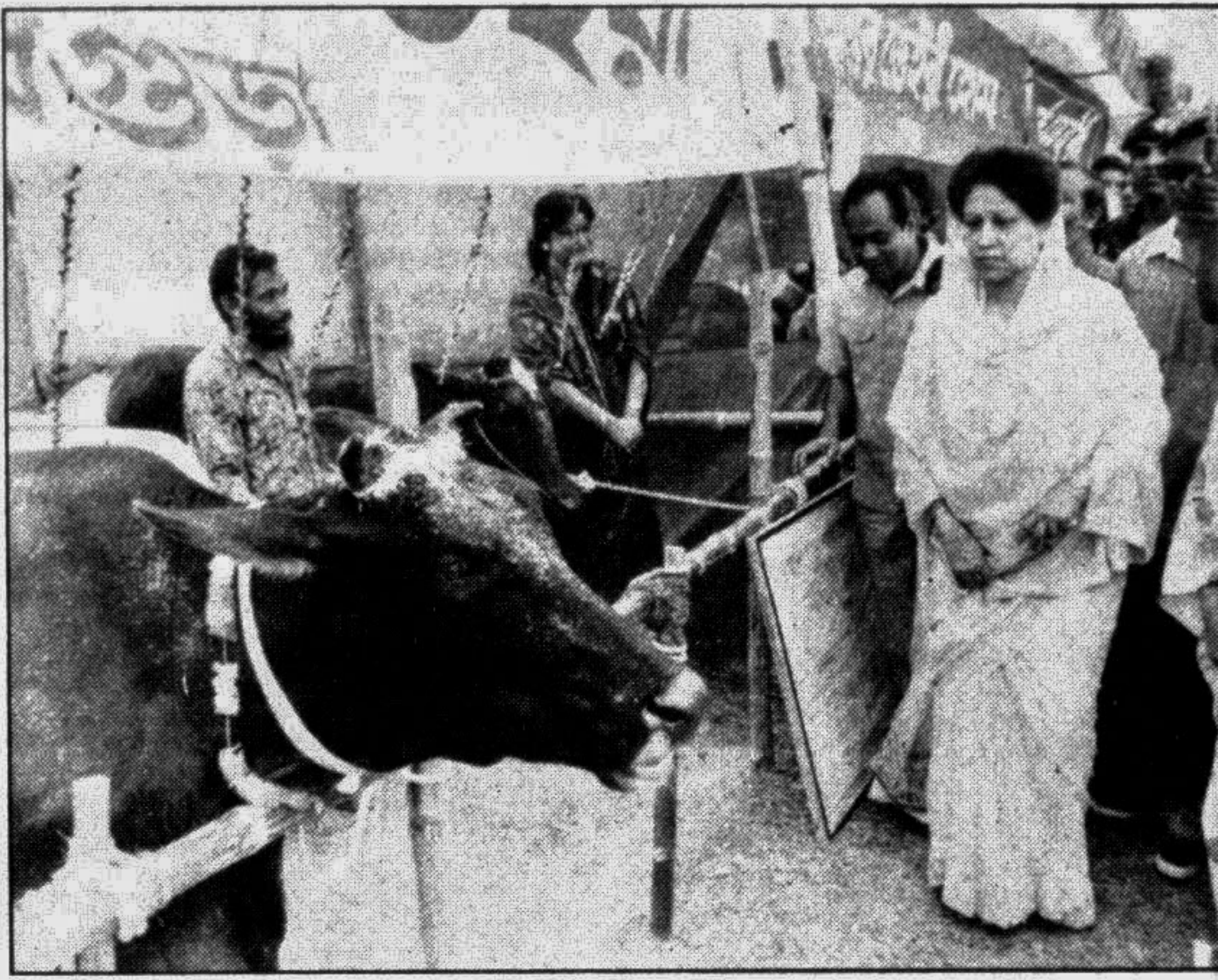
Prime Minister Begum Khaleda Zia visiting different stalls of an exhibition on high breeding livestock and poultry after opening it at Bogra stadium on April 15.

A reception was also accorded to Patwari on the same day by the Gazirhat Smriti Sangad where he donated for the treatment of two persons suffering from cancer.