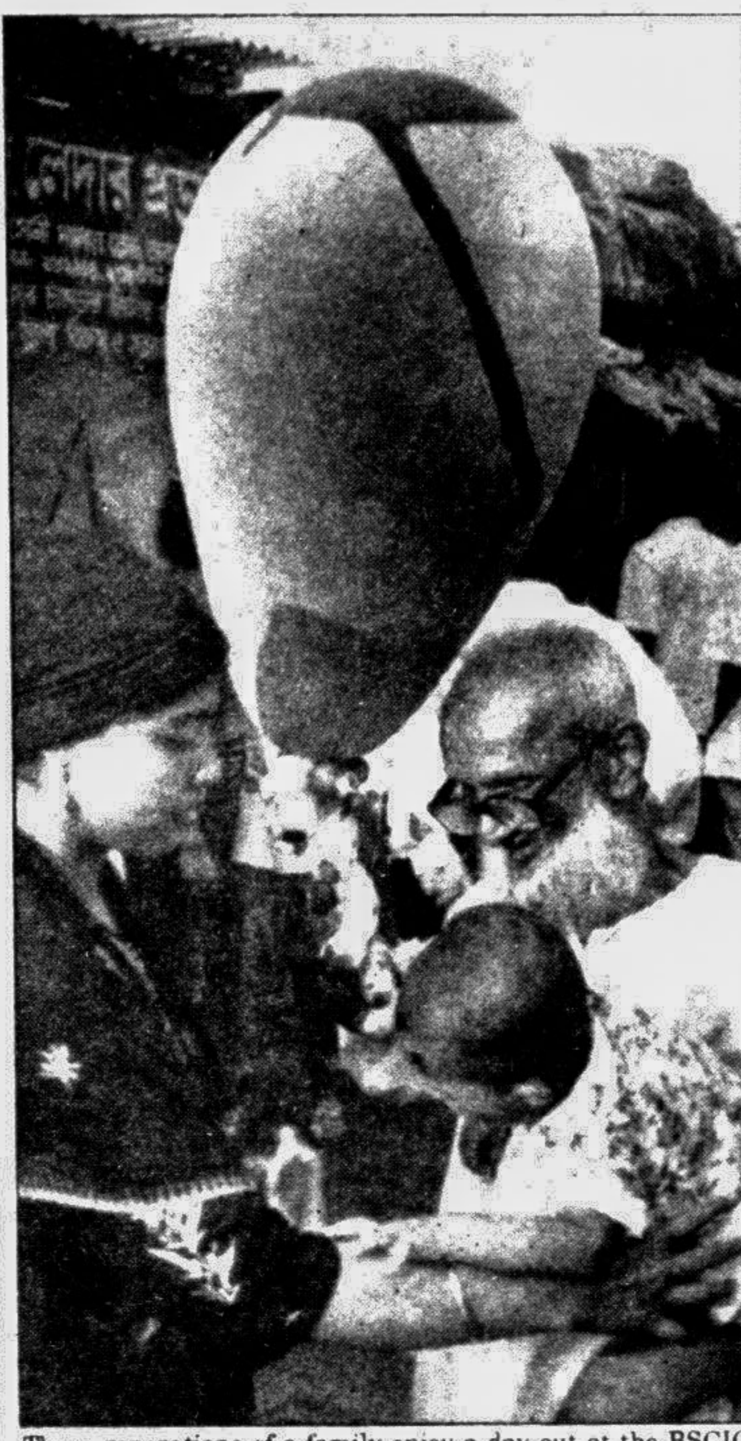
Three generations of a family enjoy a day out at the BSCIC Baishakhi mela at Dhanmondi Club ground in the city yesterday.

Published by the Editor on behalf of Media World Ltd., 52 Motijheel C/A, Dhaka-1000 and printed by him at The Sangbad Ltd., 36 Purana Paltan, Dhaka. Editorial, News & Commercial Offices : House No. 11, Road No. 3, Dhanmondi R/A, Dhaka-1205 PABX 500092-4. Advertisement : 500091 (Direct) Fax No. 88-02-863035 GPO Box No. 3257 GRAM : DAILY STAR DHAKA