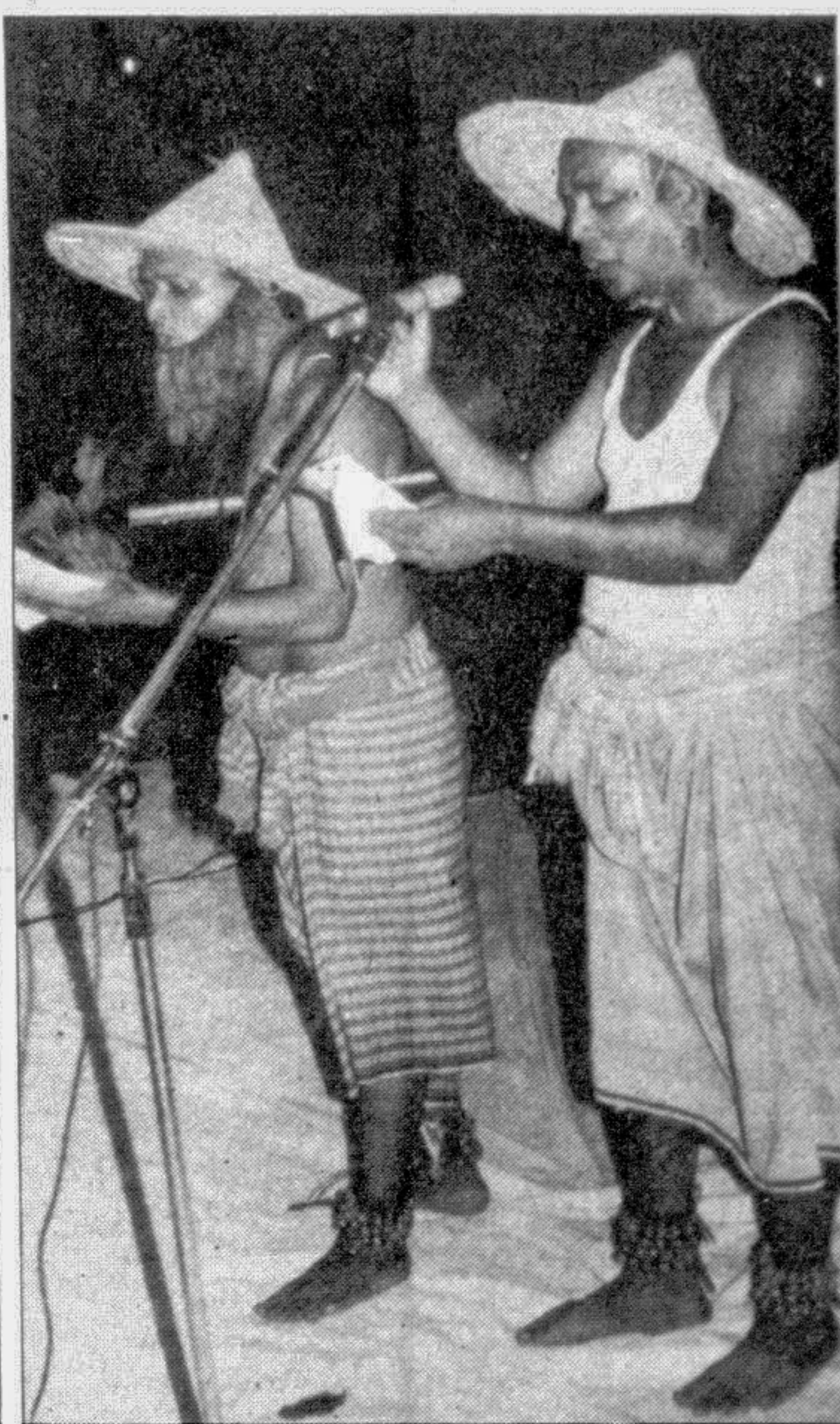
A cultural group from Chapsinawabganj presenting 'Gambhira' to celebrate Bengali new year at the Bangla Academy premises yesterday.

Earlier on April 13 the Speaker addressed the plenary of the conference and attended lunch and dinner receptions hosted, among others, by the Vice President KR Narayanan, Prime Minister Narasimha Rao, Speaker of Lok Sabha Shivraj Patil, Commerce Minister Pranab Mukherjee and Parliamentary Affairs Minister VC Shukla.