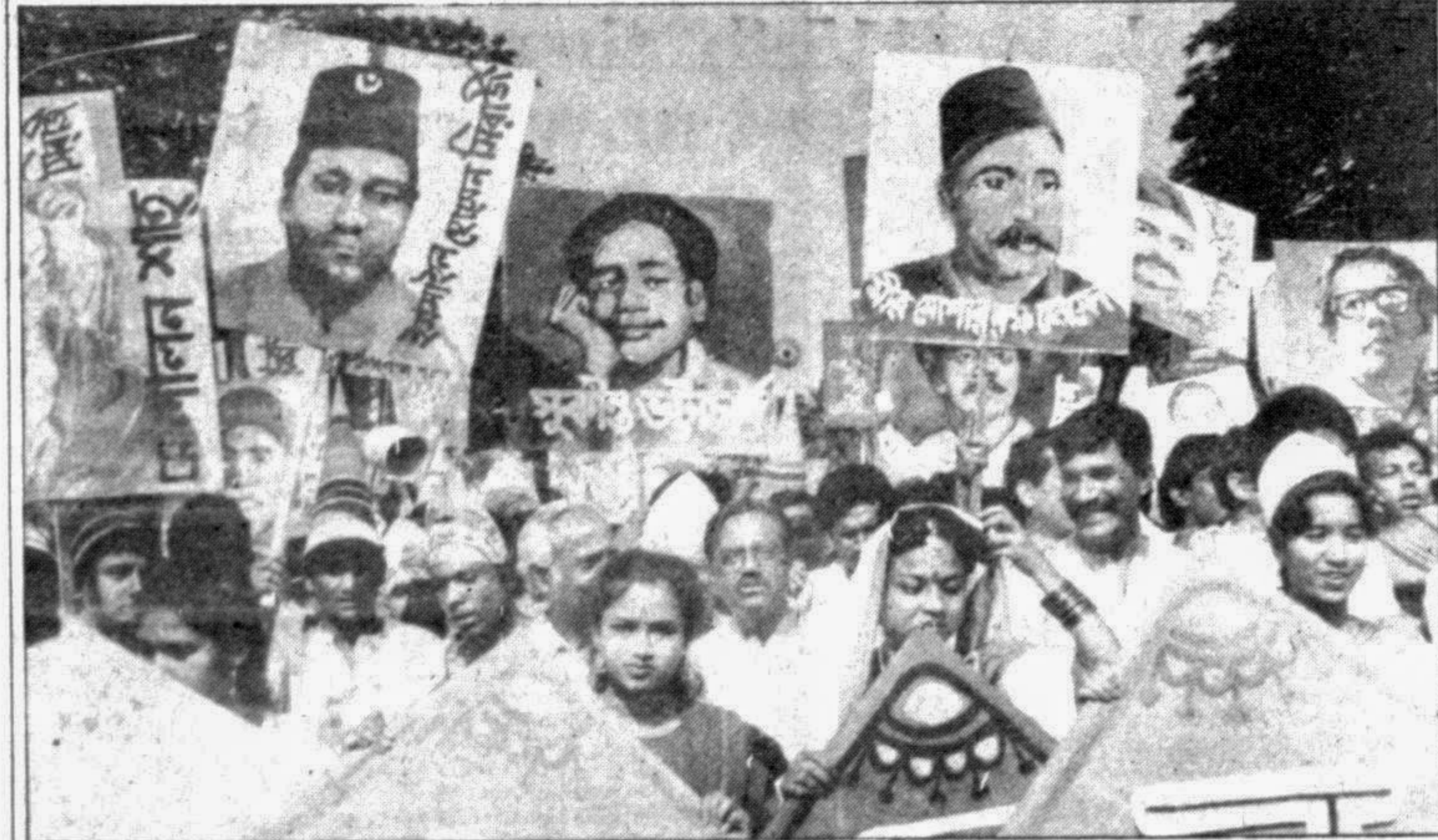
Portraits of some luminaries of Bangla literature and arts were carried by some processionists.