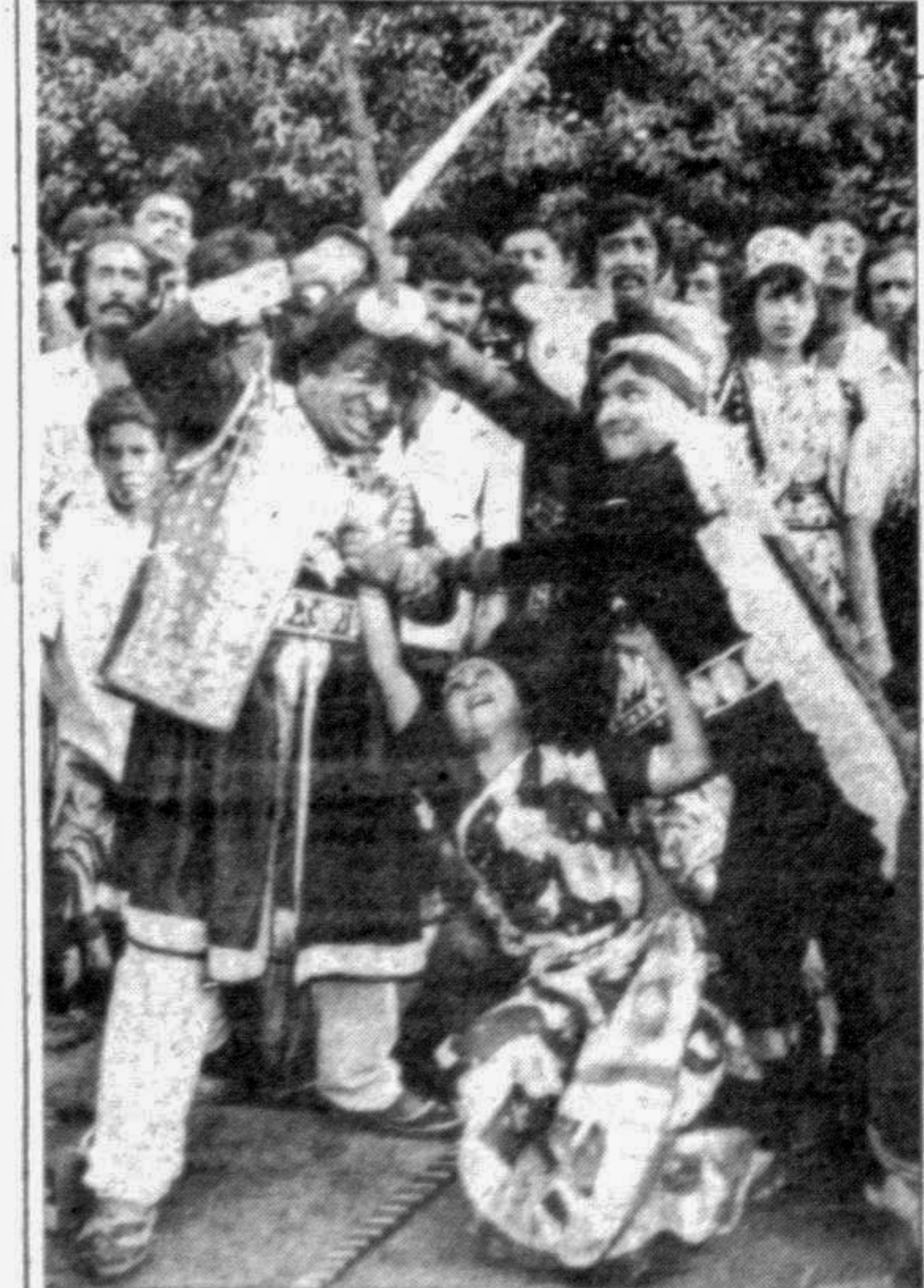
Scene from a traditional jatra at the Ramna Batamul.