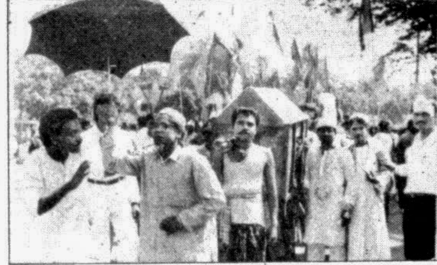
A typical Bengali village wedding scene.