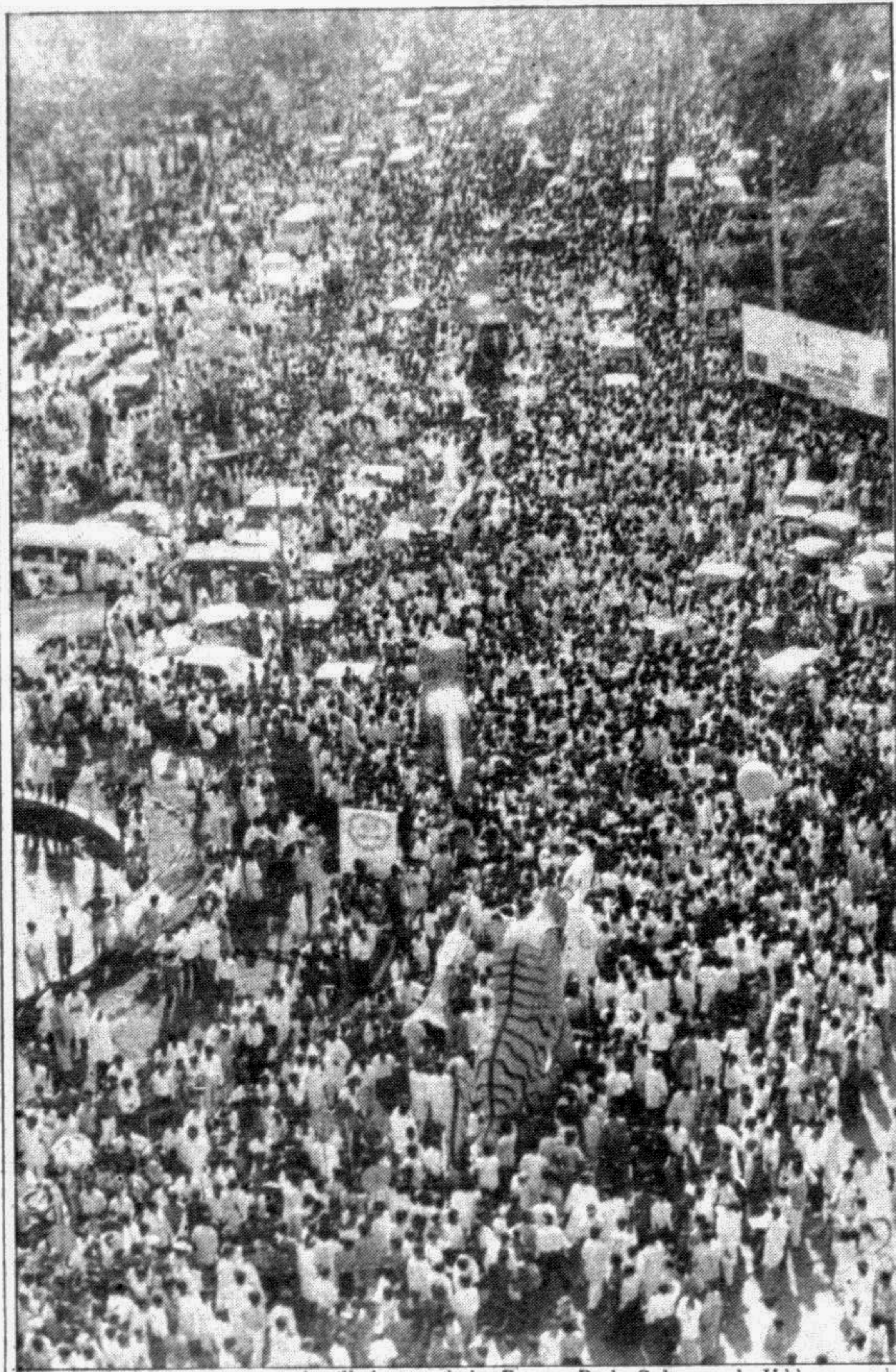
A view of the massive crowd milled around the Ramna Park, Suhrawardy Uddyan and Shahbagh areas on the occasion of Pahela Baishakh Wednesday.