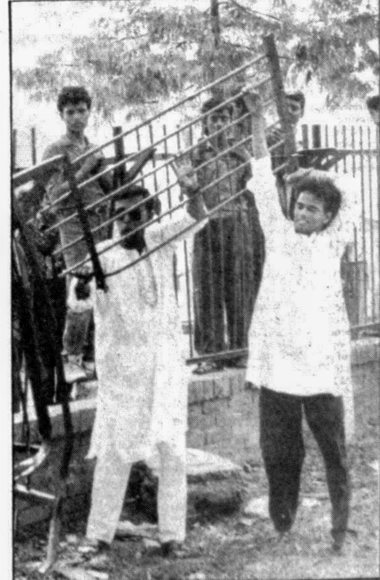
Agitated youths pull down part of the Suhrawardy Uddyan fencing.