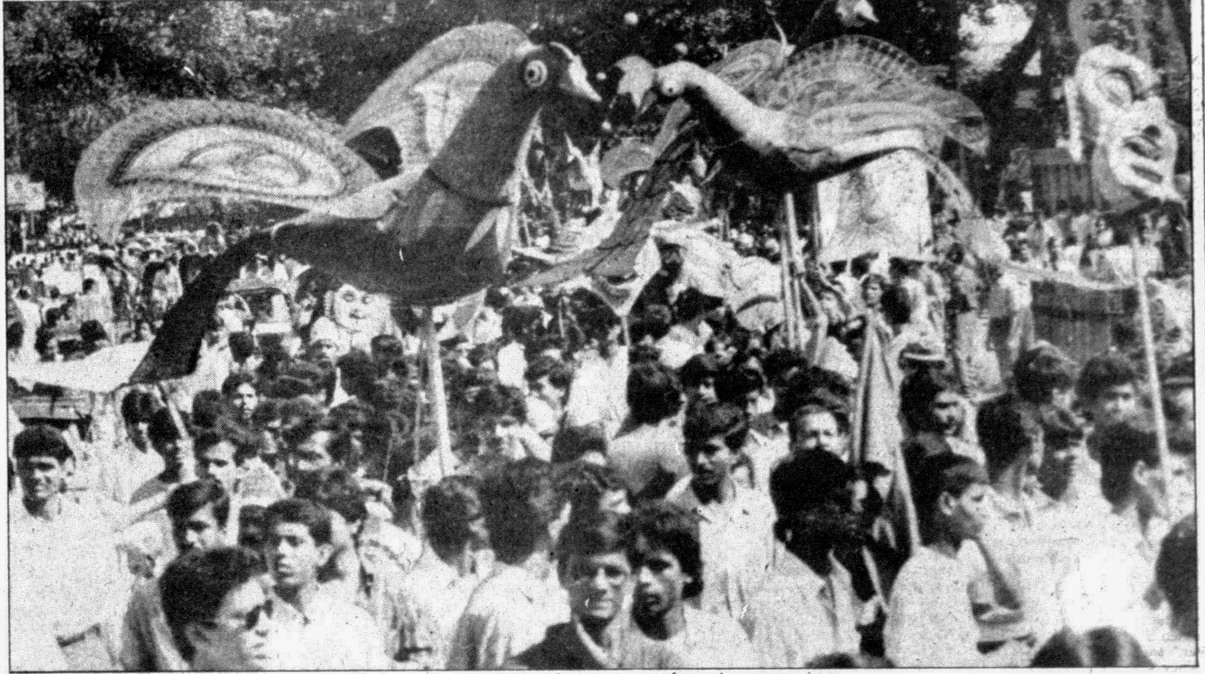
Birds, masks and what not lent variety to the various processions.