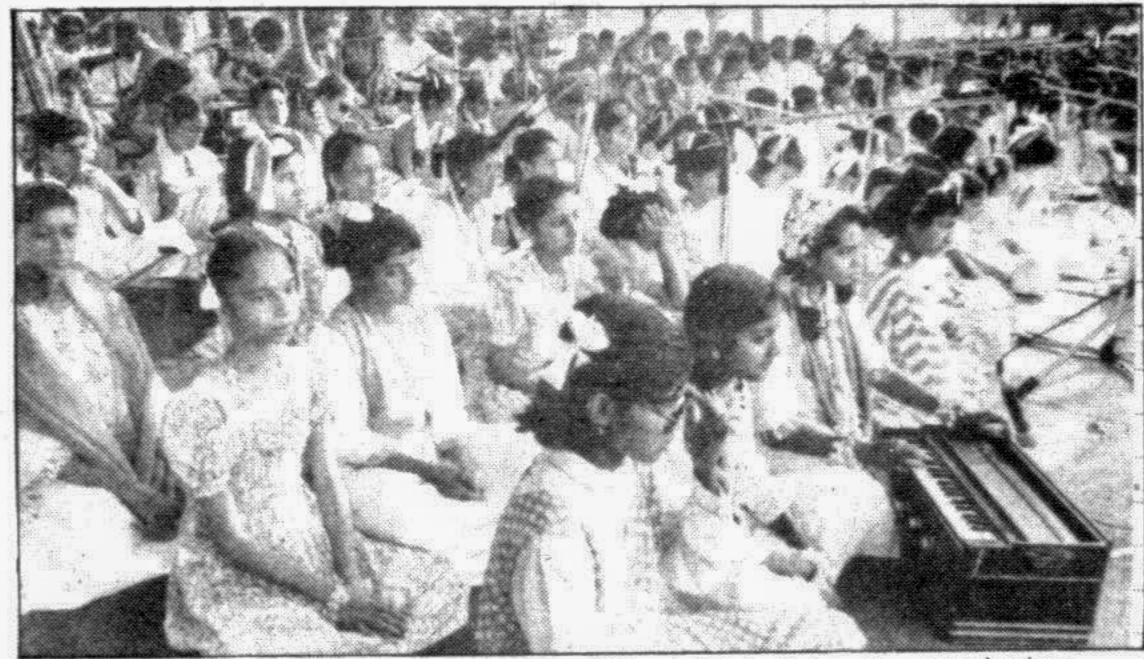
Members of Chhayanaut presenting their traditional Pahela Baishakh musical soiree.