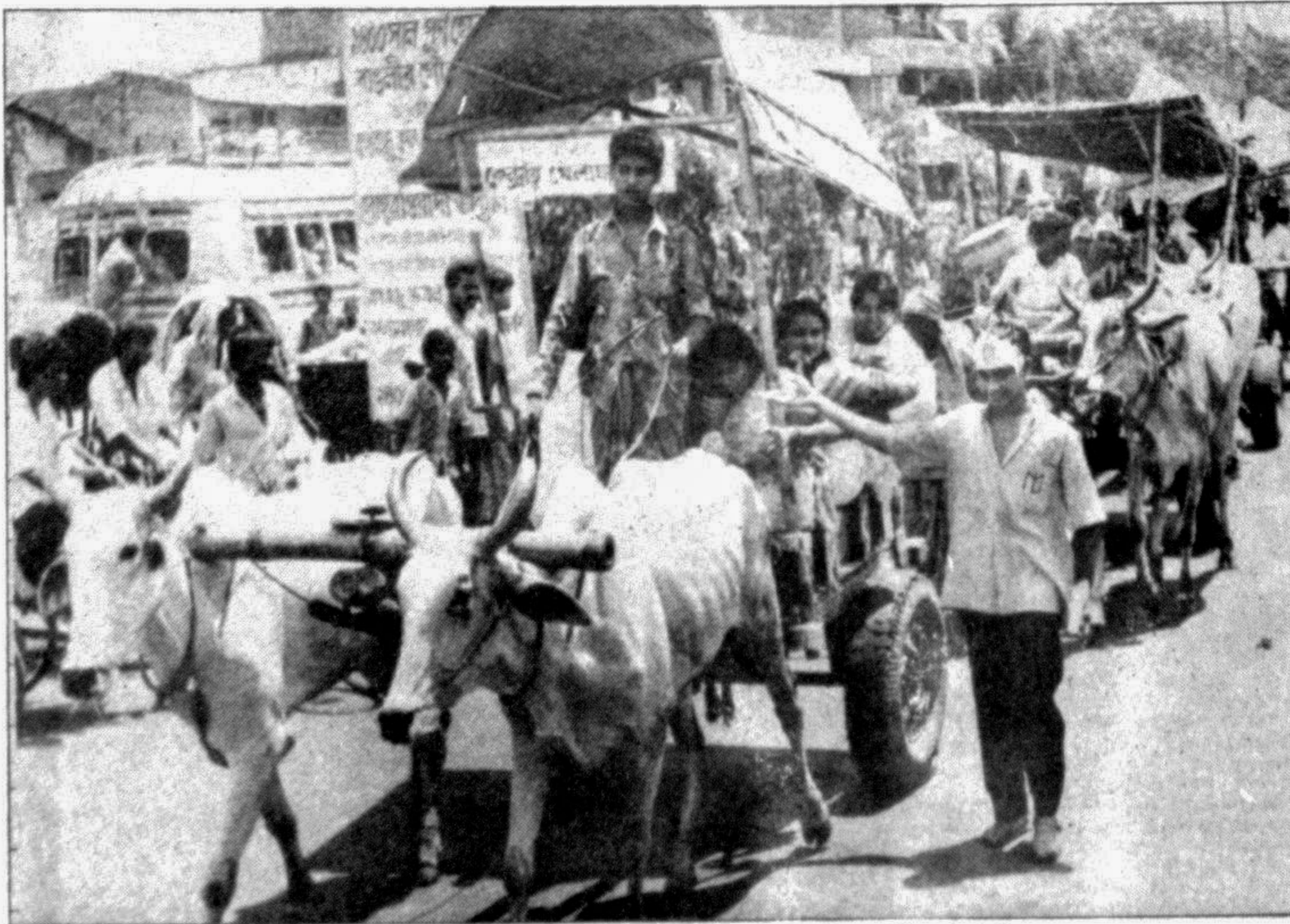
Bengali culture takes a ride on the familiar vehicle of rural Bangladesh.