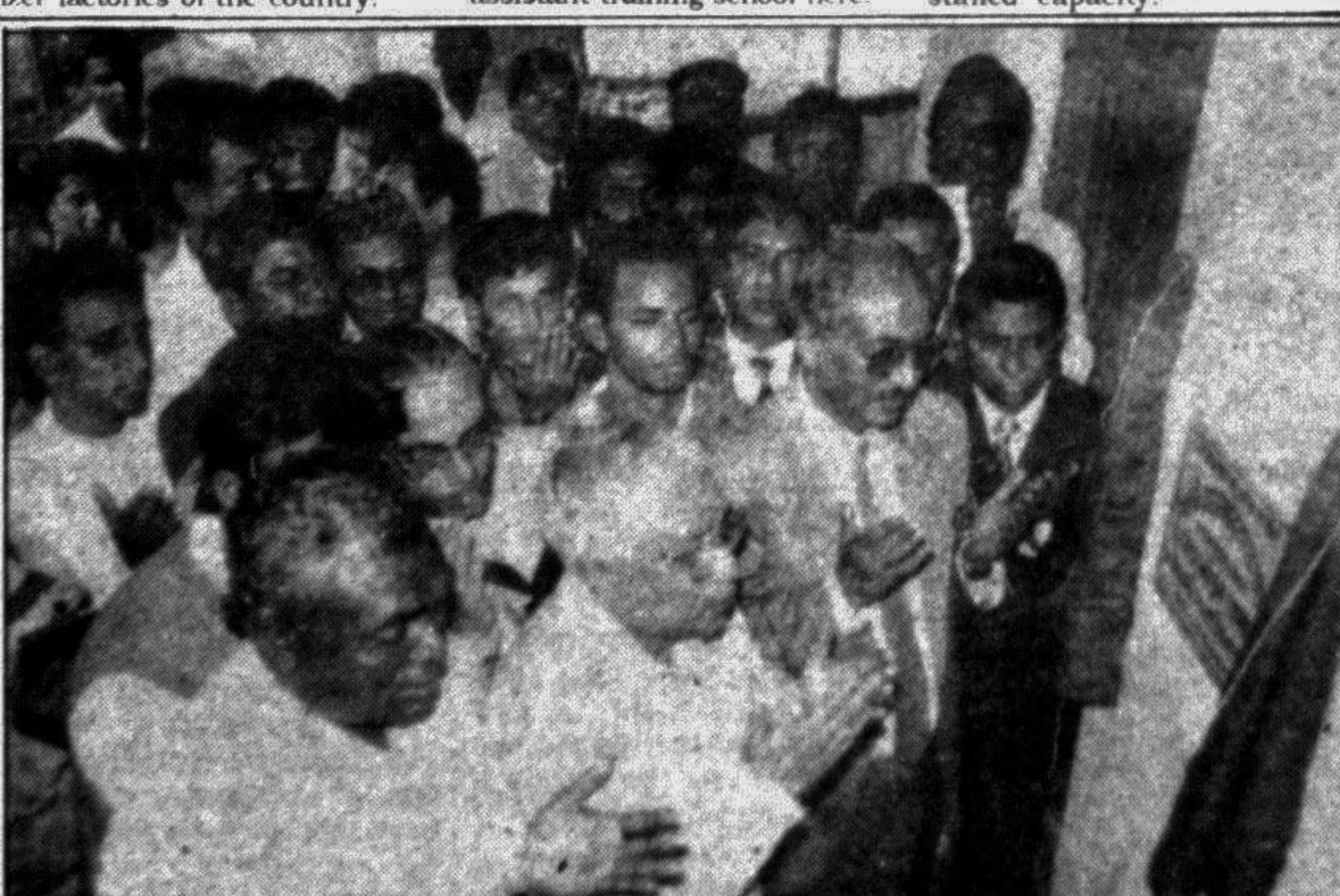
SYLHET: Munajat was offered after laying the foundation stone of a diabetic hospital. Finance Minister M Saifur Rahman recently laid the foundation here.

According to a CMP press release, the meeting presided over by CMP commissioner, Osman Ali Khan decided that all buses and mini-buses plying between Chittagong city and southern region will load and unload passengers at the Bhaddarhat Bus Terminal and all city buses, and taxis and rickshaws will stop at their respective stands. No vehicle shall be parked indiscriminately on the roadside.