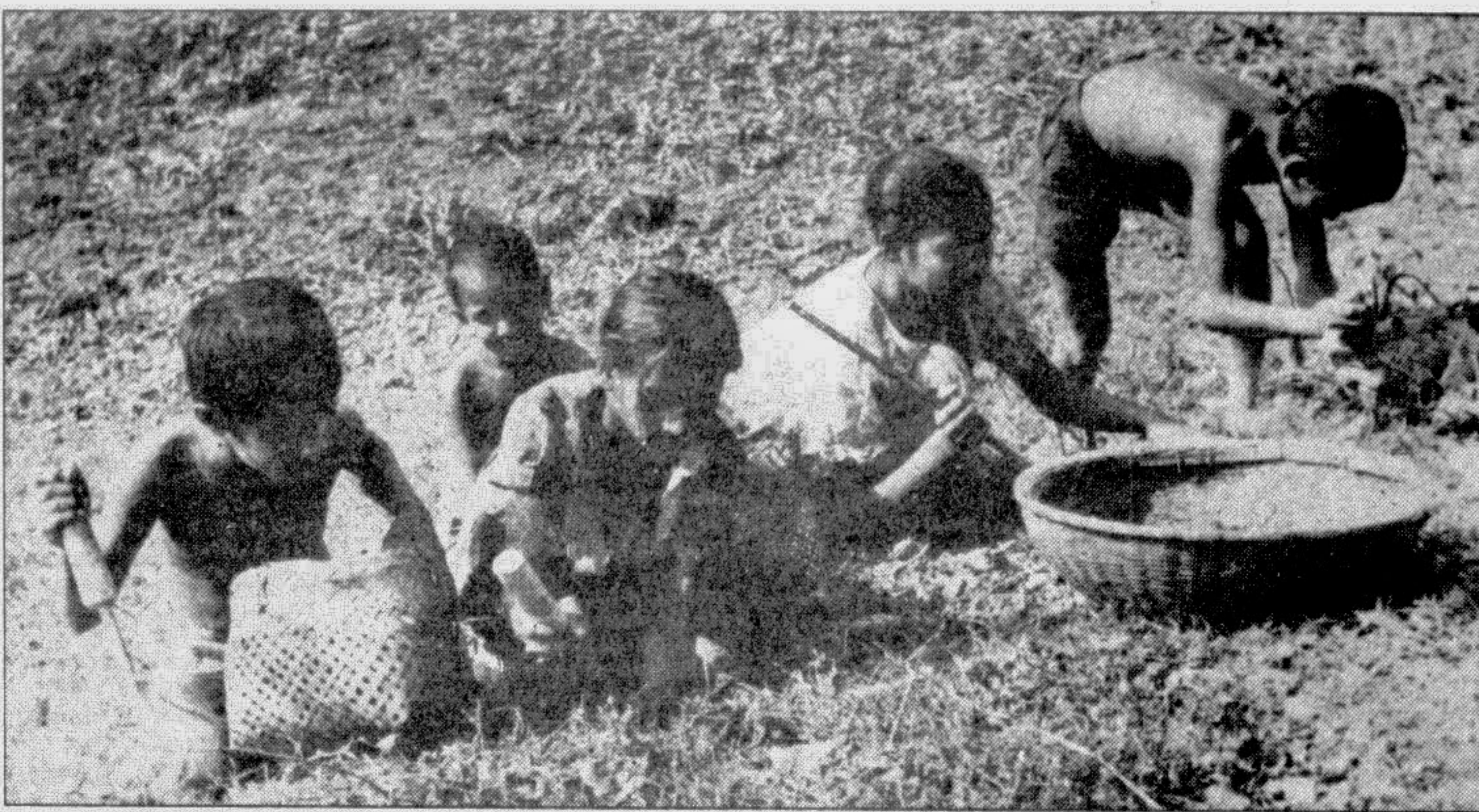
POPULAR SWEET POTATO: Now is the harvesting season of sweet potato. Children are collecting potatoes.

A case was lodged with Satkhira ps in this regard.