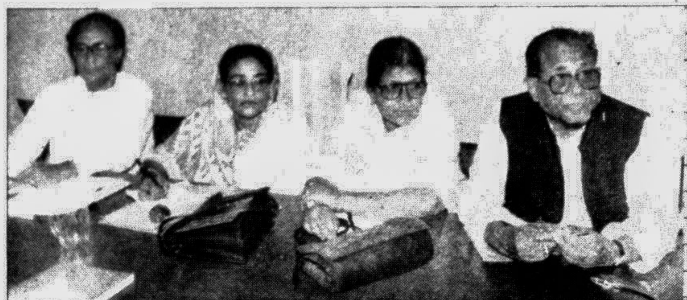
Awami League President Sheikh Hasina presiding over the Working Committee meeting at the party office at Bangabandhu Avenue yesterday. (Story on Page 1)

Barrister Rafiqul Islam Mia, Minister for Works will inaugurate this seminar at 9:30 am as chief guest.