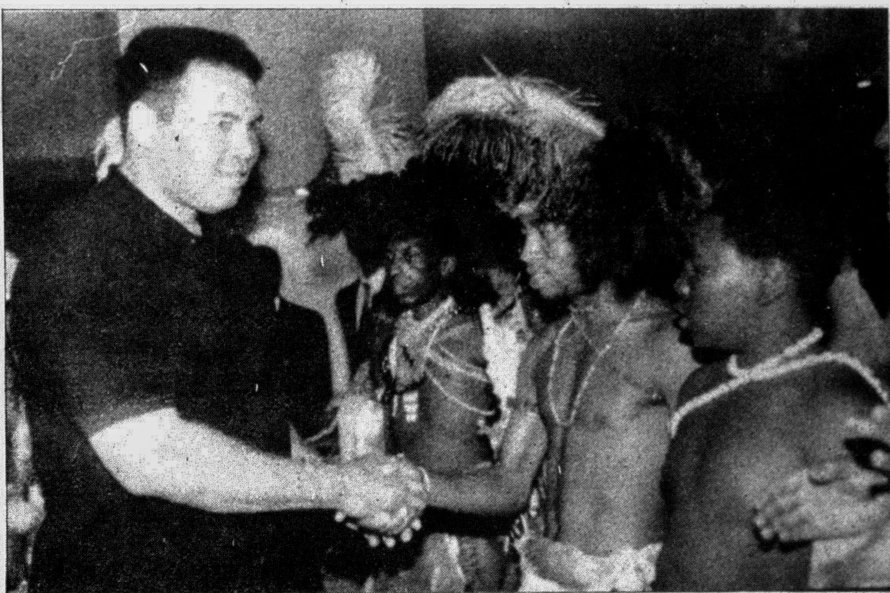
Boxing legend Muhammed Ali greets traditional dancers upon his arrival in the South African city of Johannesburg on Saturday. Ali met the nation's black and Moslem leaders.