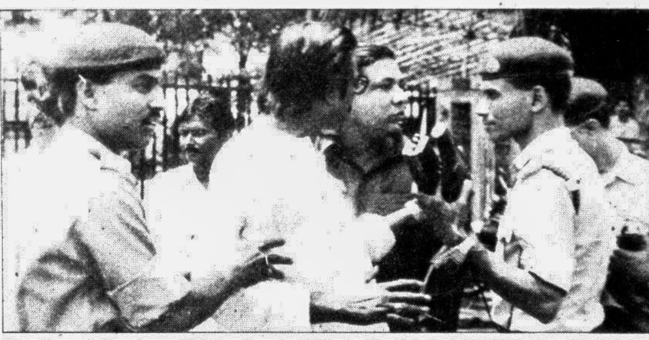
The General Secretary of Jatiya Gonatantri Party Shafiqul Alam Prodhan was arrested by police in front of the National Press Club yesterday while leading a procession demanding solution to Farakka problem.