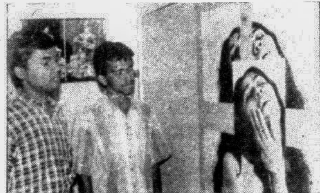
Women focus on themselves

The exhibit was an eye-opener indeed as to what our women can achieve through the 2-D film media.