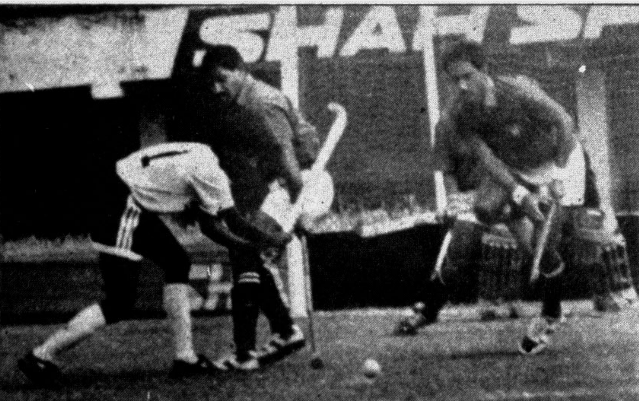
Action from yesterday's Independence Day hockey tournament match between Mohammedan Sporting Club and Sonali Bank at the Hockey Stadium. Mohammedans beat Sonali Bank 1-0.