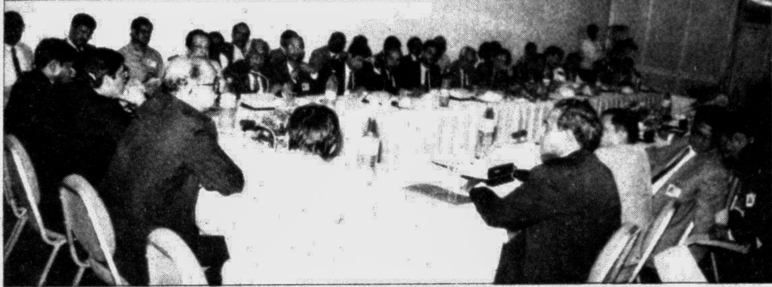
Foreign Minister A S M Mostafizur Rahman presiding over the meeting of SAARC Council of Ministers at Hotel Sheraton yesterday.