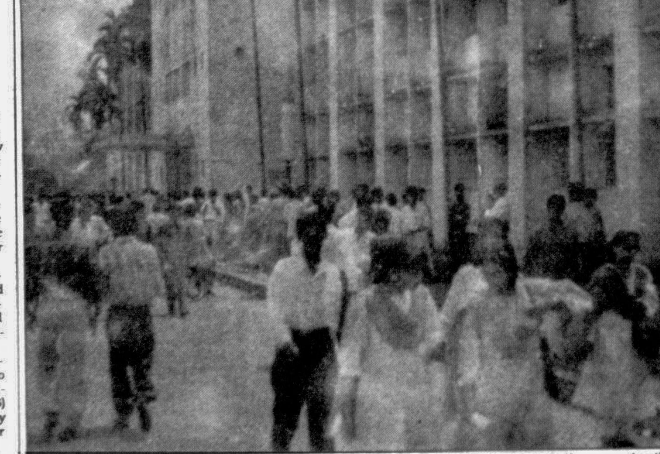
MYMENSINGH: Students are coming out from Mymensingh Medical College on April 2 boycotting the admission test of MBBS course for the session of 1992-93. They were detained for three hours inside examination halls as answer sheets were not attached to the questionnaire.

BARISAL, Apr 7: Bangladesh Krishi Bank has disbursed about Taka 4.32 crore as agricultural loan among the farmers of the district against its target of Taka 7.35 crore during the current fiscal year, reports UNB. Official sources said the bank also realised Taka 3.34 crore from the farmers against target of Taka 8.57 crore during the same period. The loan is being disbursed through the 23 branches of the bank to boost agri production in the district. A BSS report says: A meeting of the editors of different dailies of Barisal division was held at the office of the local daily Biplabi Bangladesh recently with Md Hossain Shah, Editor of daily Shahnama of Barisal, in the chair. A nine-member committee of the editors of the division was formed with Nurul Alam Farid, Editor of Biplabi Bangladesh, as President and K M Enayet Hossain, Editor of daily Rupantar of Patuakhali, as Secretary. Other office bearers of the committee are: Hossain Shah, Vice-President, Indrajit Kumar Das, Treasurer and M A Matin, Office Secretary. UNB adds: Five people received burn injuries, 14 dwelling houses and property worth about Taka 30 lakh were gutted in a devastating fire at Charmedua village in Mehendiganj thana on Thursday.