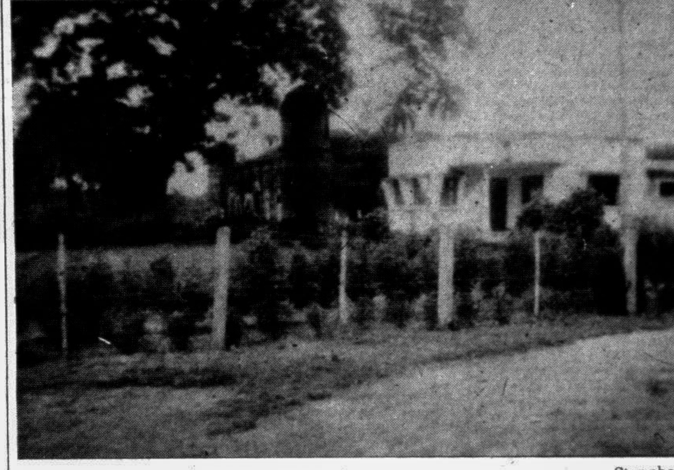
KHULNA: The present view of the Shatgumbaz mosque.