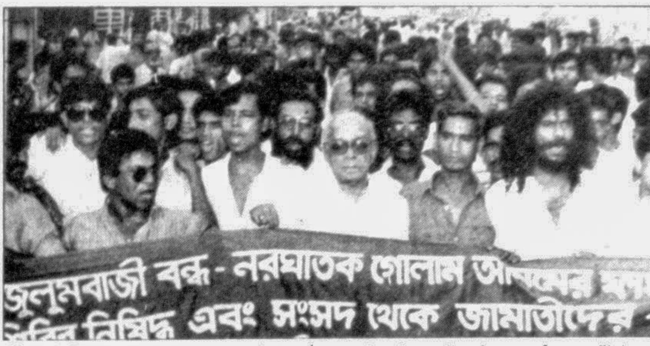
Nirmul Committee procession in the city yesterday demanding ban on Jamaat Shibir politics.

The applications must be sent to the Head Office, Sena Kalyan Sangstha through District Armed Services Boards.