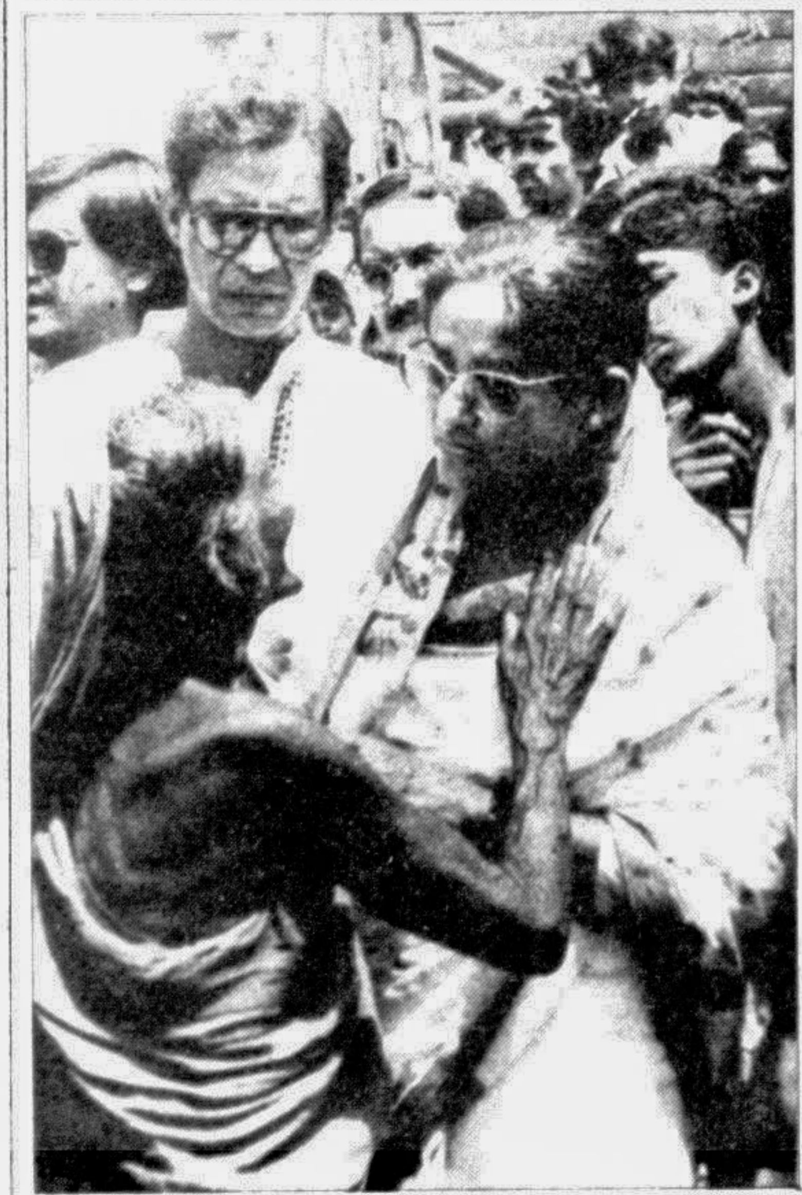
Awami League Chief and Leader of the Opposition in Parliament Sheikh Hasina consoling a fire victim during her visit to Pearabagh slum in city yesterday.

Indian External Affairs Minister Dinesh Singh said here yesterday that the SAARC was the destiny for the people of the South Asia and expressed his country's total commitment to the association, reports BSS. "We attach great importance to the SAARC," he told newsmen on arrival here and said two postponements of the seventh summit would in no way affect the regional forum adversely. "It is a matter of past and we should now look forward," Singh said and added that SAARC covered a lot of ground after it was launched under Bangladesh's leadership. He said that the second cycle of the SAARC summits beginning with the seventh See Page 12 Col 1