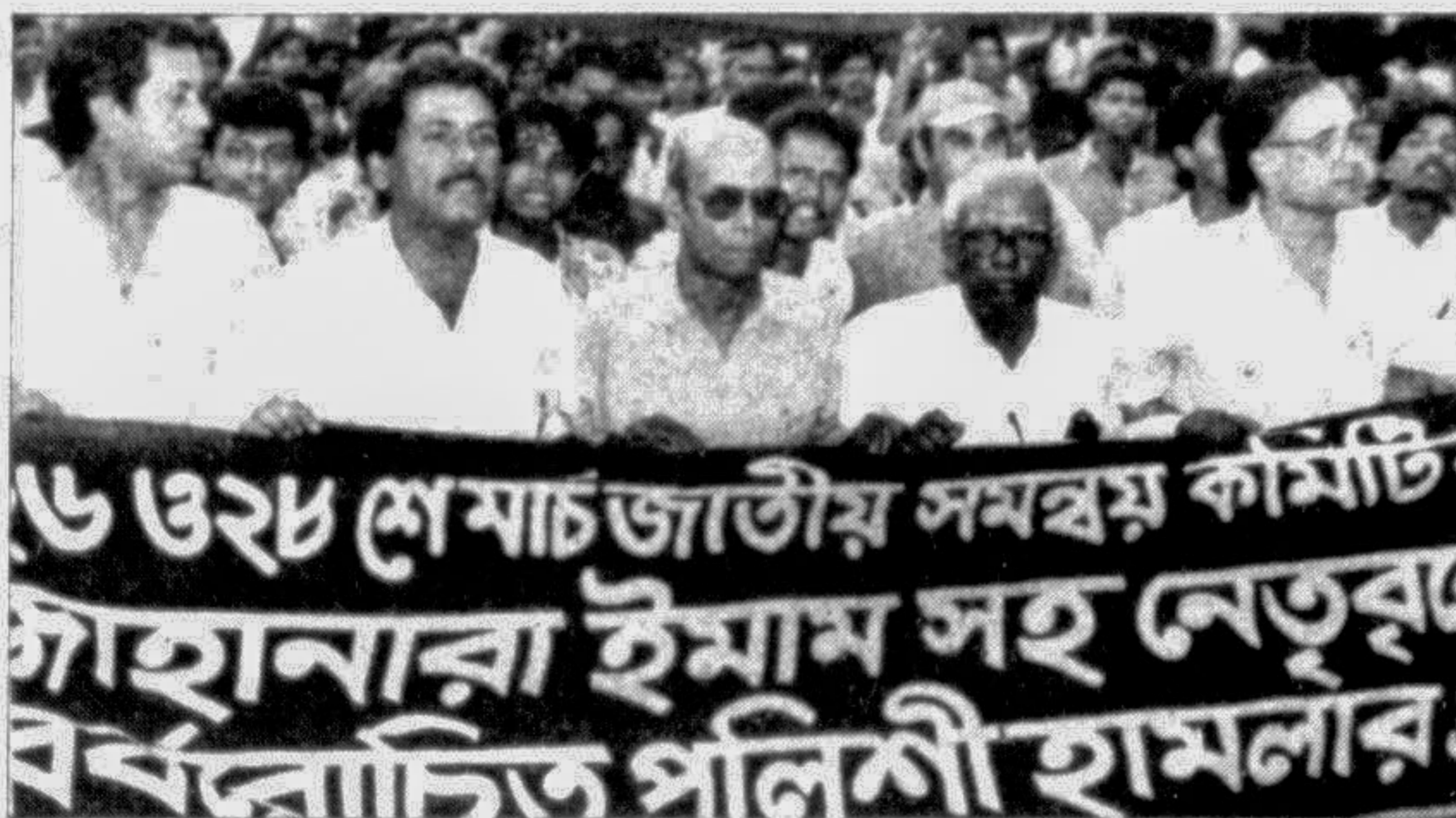
Sammilita Sangskritik Jote (combined cultural group) brought out a procession in city yesterday protesting police assault on the leaders and workers of Nirmul Samanannaya Committee on March 26 and 28.

Admission tests will begin from April 24. Schedule of the entrance exams will be announced later.