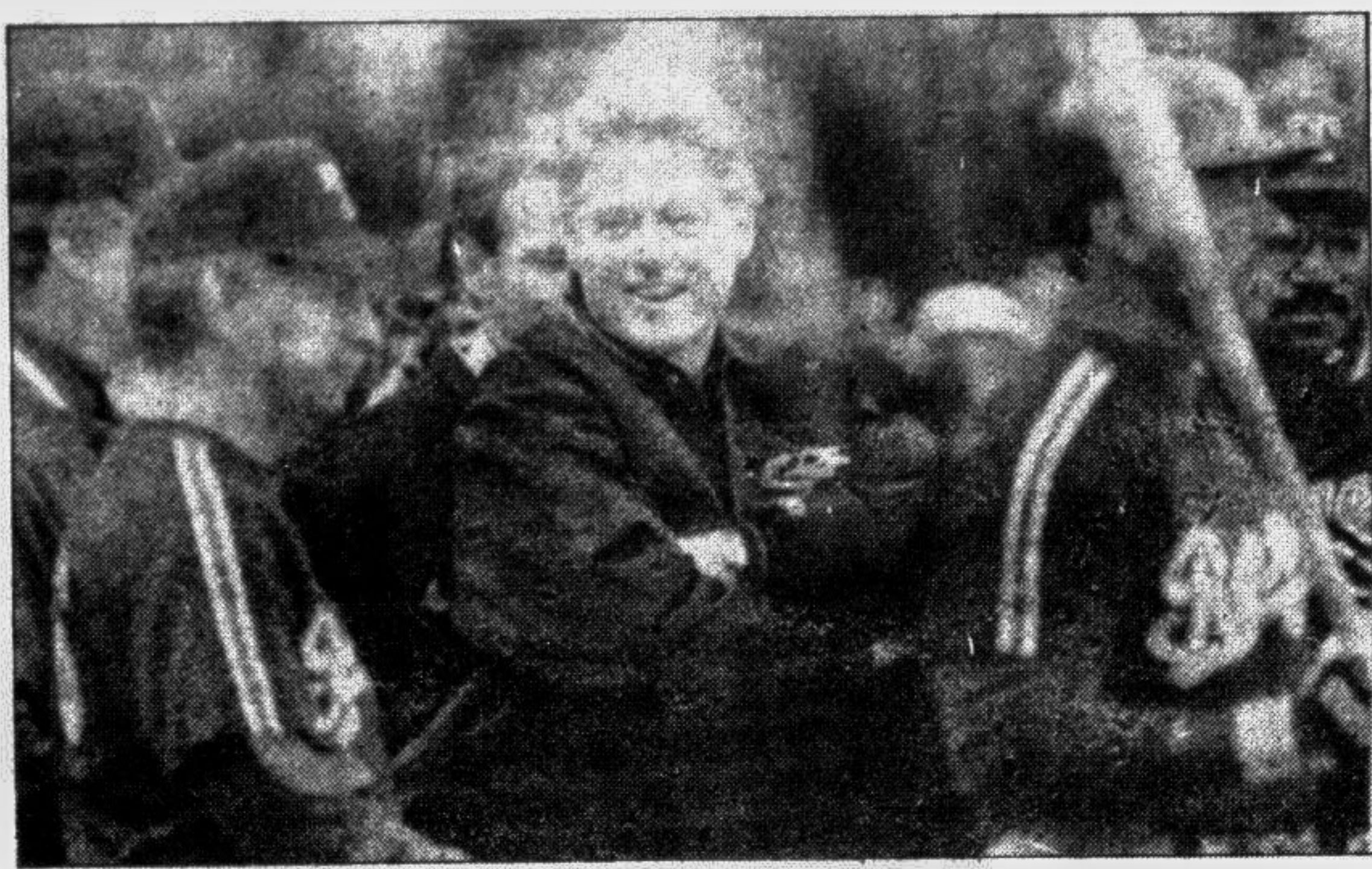
US President Bill Clinton (C) with the Texas Rangers in the batting cage during batting practice prior to the throwing out the first ball which marks the opening of a baseball season at the Camden Yards, Baltimore on Monday. The Rangers open their campaign against the Baltimore Orioles.

None of the big names were in action on Monday. Other top-ranking players competing for the 126,000 dollar singles prize include American Ivan Lendl, Michael Stich of Germany and Dutchman Richard Krajicek.