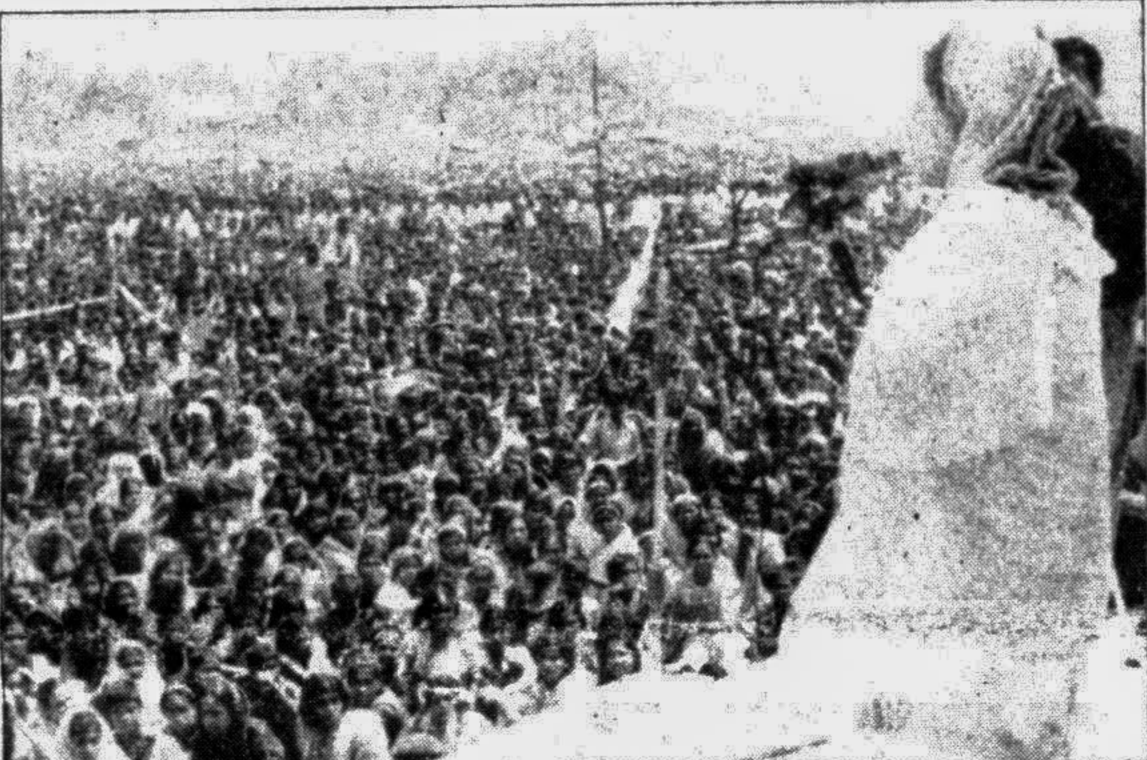
Prime Minister Begum Khaleda Zia addressing a public meeting at Sreebardi College ground in Sherpur yesterday.

The motive was to avenge the death in January of Sathasivam Krishnakumar, See Page 12 Col 4