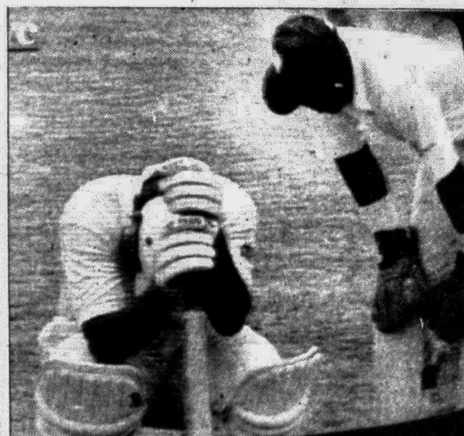
West Indian wicketkeeper Junior Murray offers a few words of sympathy as Pakistan batsman Inzamamul Haq agonises in pain after a Courtney Walsh delivery hit him on the groin during the fifth and final one-day international at Georgetown, Guyana on April 3. The match was tied.

Belenky won a bronze medal in the all-around competition at the Summer Olympics in Barcelona, where he was a member of the Unified Team of former Soviet republics.