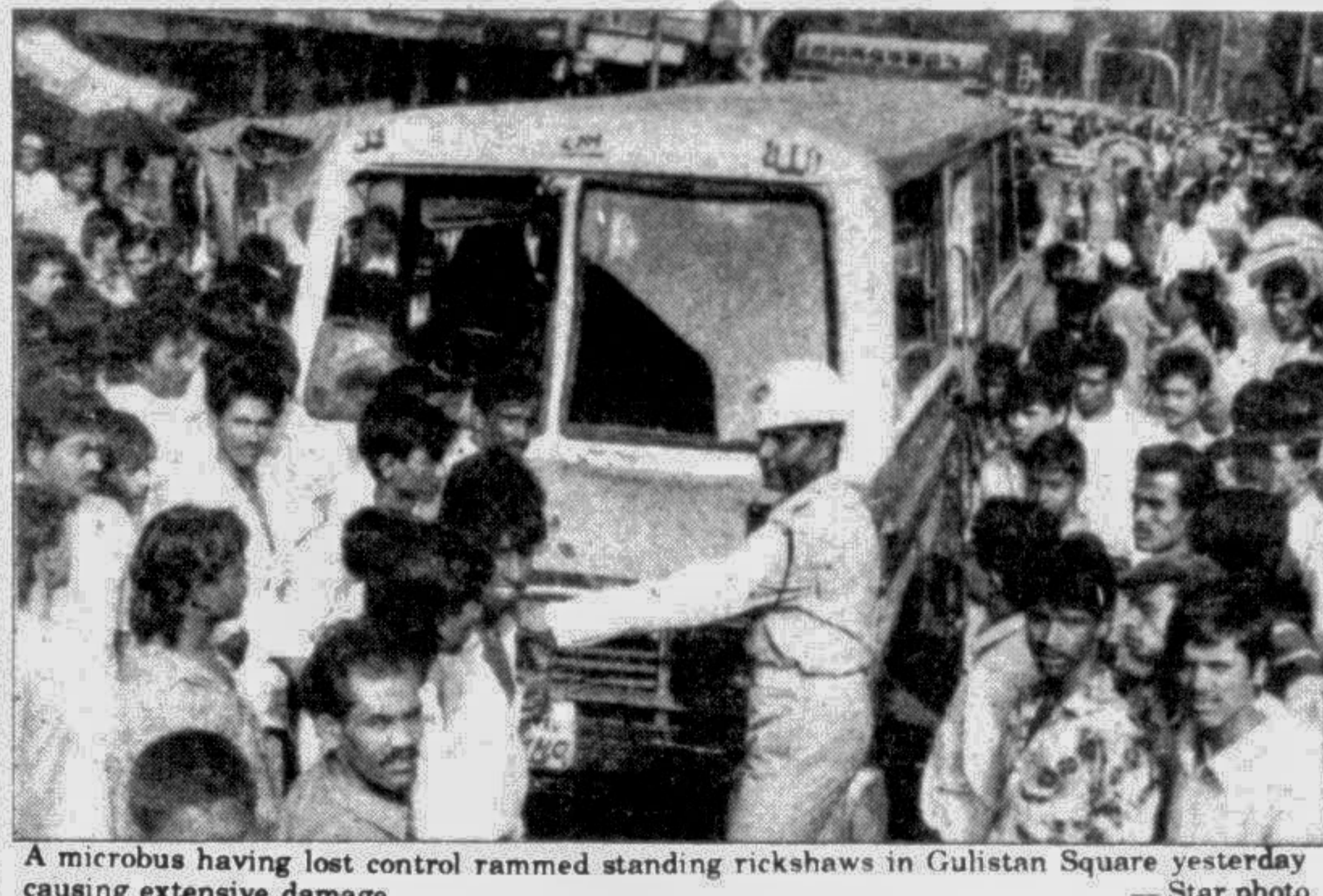
A microbus having lost control rammed standing rickshaws in Gulistan Square yesterday causing extensive damage.