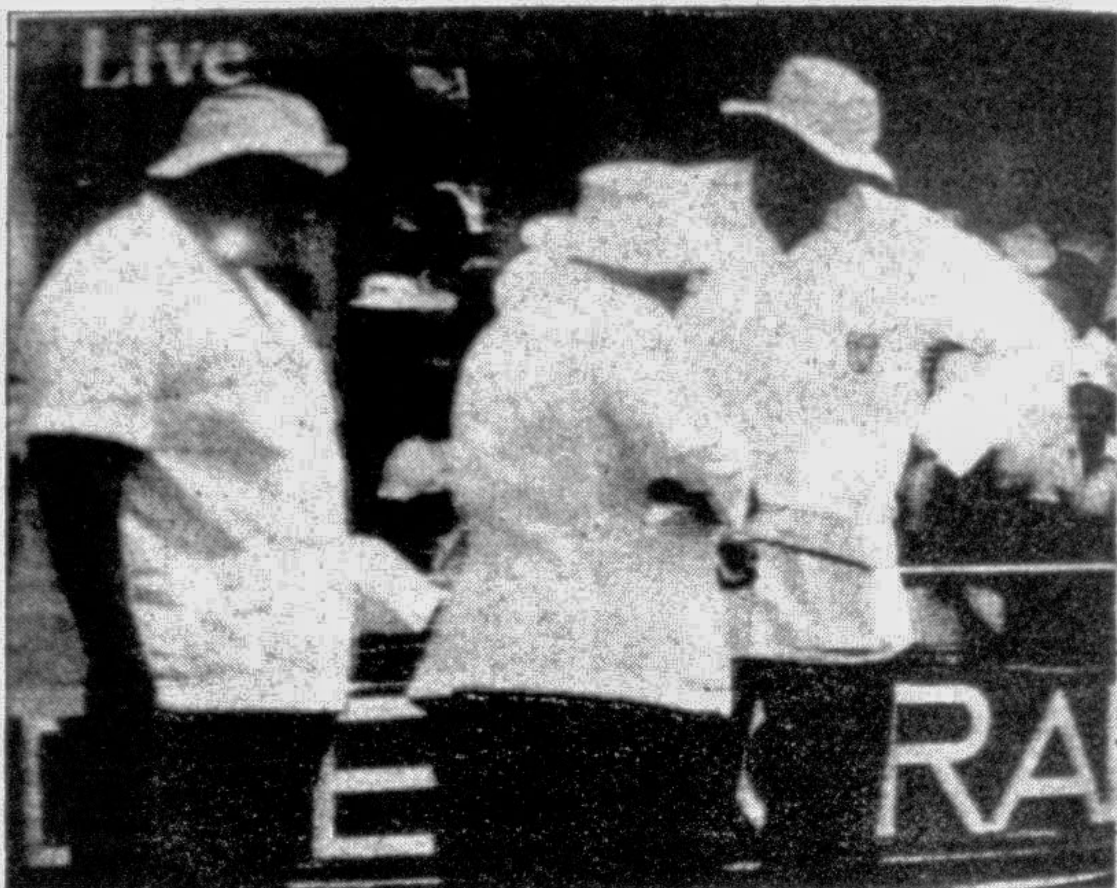
SHAPING UP... Not the umpires but the ball, which lost its shape during the Pakistan innings in the fifth and final one-day against the West Indies at Georgetown, Guyana on Saturday. The match ended in a draw.