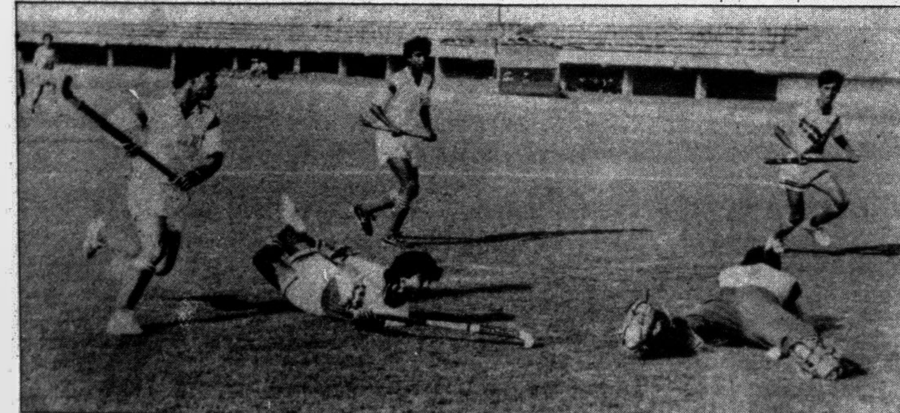
Action from the inaugural match of the Independence Day hockey tournament between Sadharan Bima and Wari Club at the Hockey Stadium yesterday. Bima won by three goals to one in the tie-break after the regulation period ended goalless.

Capriati could learn a valuable lesson from her opponent. "I made all the errors, especially in the third set," Capriati said. "I just got frustrated and lost patience. I don't feel like she won it, I feel like I lost it and gave it to her."