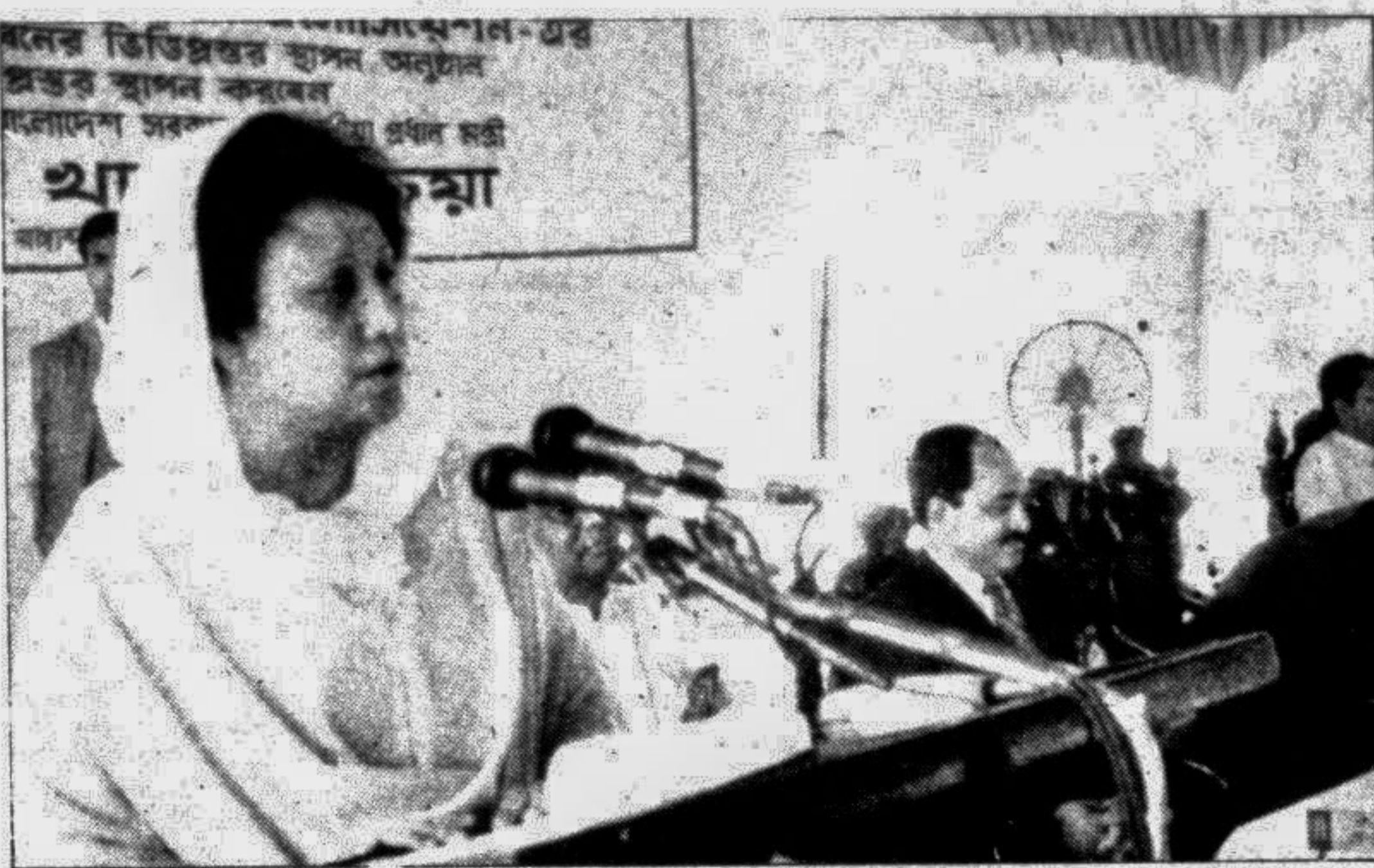
Prime Minister Begum Khaleda Zia addressing the foundation laying ceremony of the Dhaka Young Men's Christian Association (YMCA) building at Kakrail yesterday.