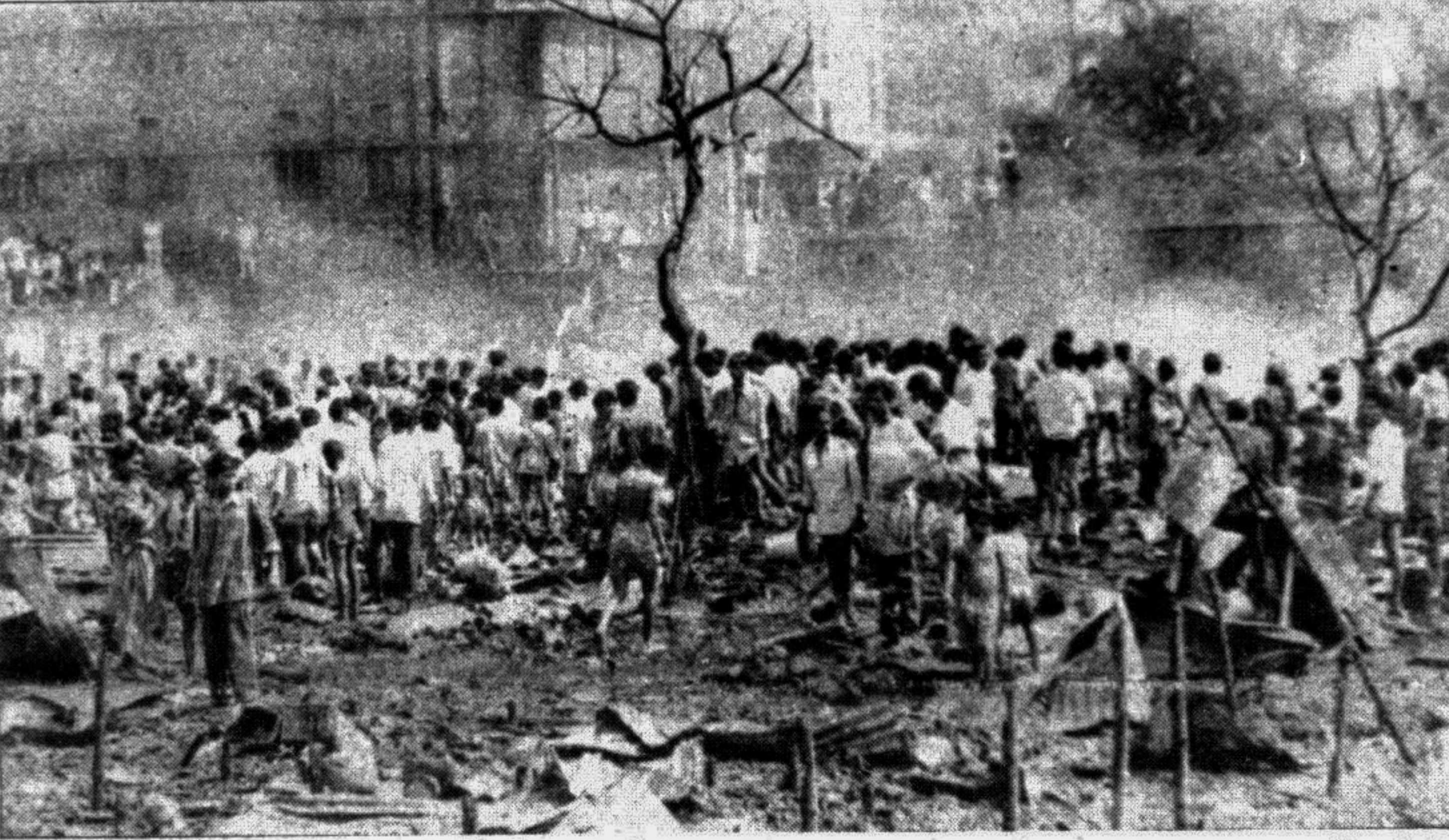
Pearabagh slum area in Magbazar gutted by fire yesterday.

Fraudulent practice by a Pakistani firm operating from Chittagong Export Processing Zone may affect Bangladesh's garments exports to the United States, reports UNB. The administration's failure to take legal action against the offending firm has already angered the US authorities, official sources said. They said the Pakistani firm — Azmat Bangladesh Ltd — exported bed sheet and pillow covers worth 675,000 dollars to the United States in August 1991 from Pakistan but showing the consignment as of Bangladesh origin. The consignment was actually exported from the Karachi port while the firm, in violation of rules, showed Chittagong as the port of shipment in an effort to exploit the facilities enjoyed by Bangladesh.