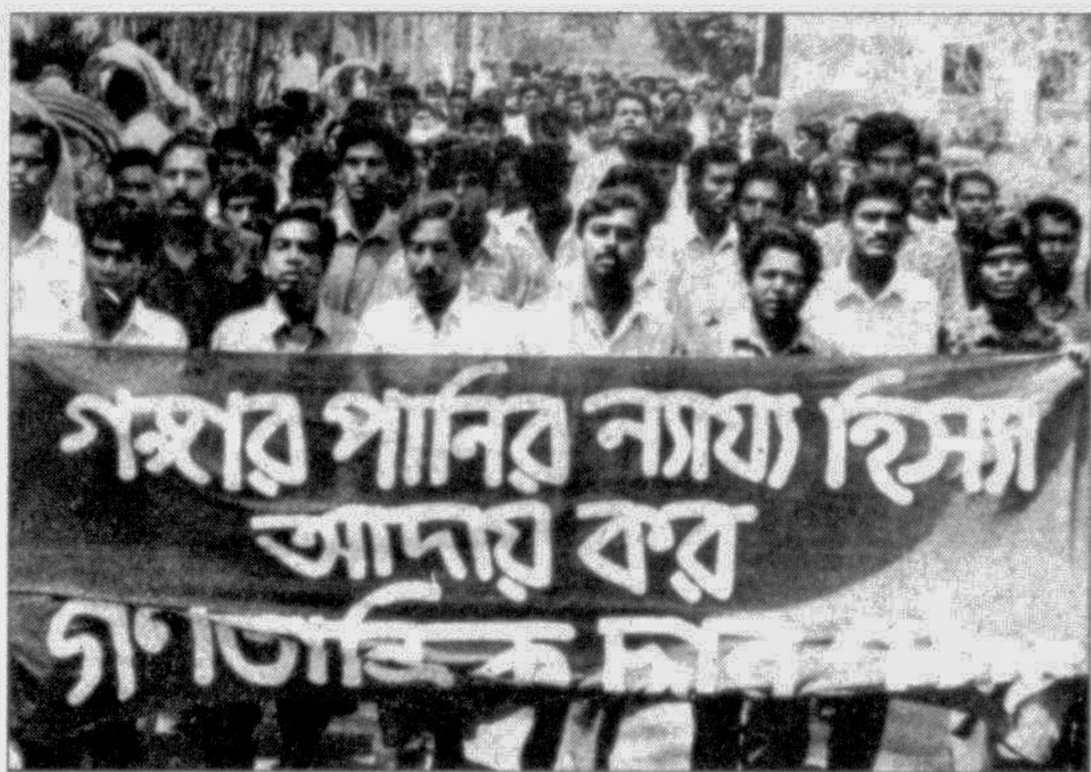
Ganotantrik Chhatra Oikya rally in city yesterday demanding legitimate share of the Ganges water.