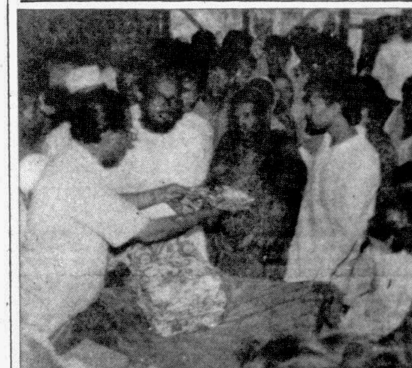
GOPALGANJ: Kazi Abdur Rashid, MP distributing relief goods among the fire victims at Goalgram village under Kasiani thana of the district recently.

The local people are not constructing new houses for the high cost of housing materials. Consequently, the house rent is up. Most of the educational institutions have no requisite furniture, laboratory apparatus, sports materials and above all teachers.