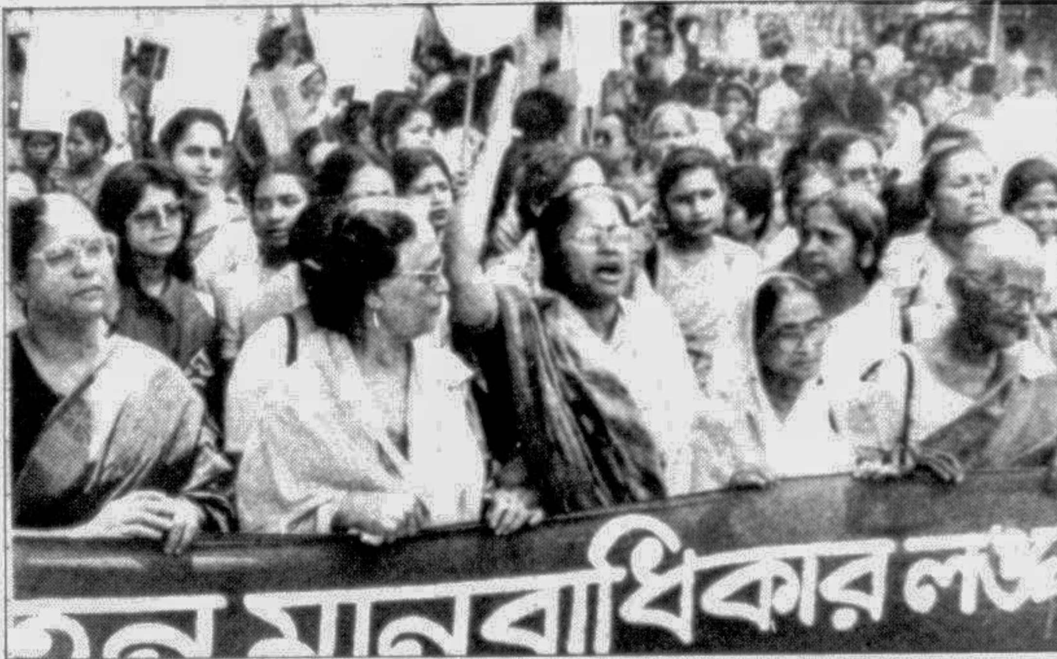
Bangladesh Mahila Parishad brought out a procession in city yesterday marking its 8th biennial council.