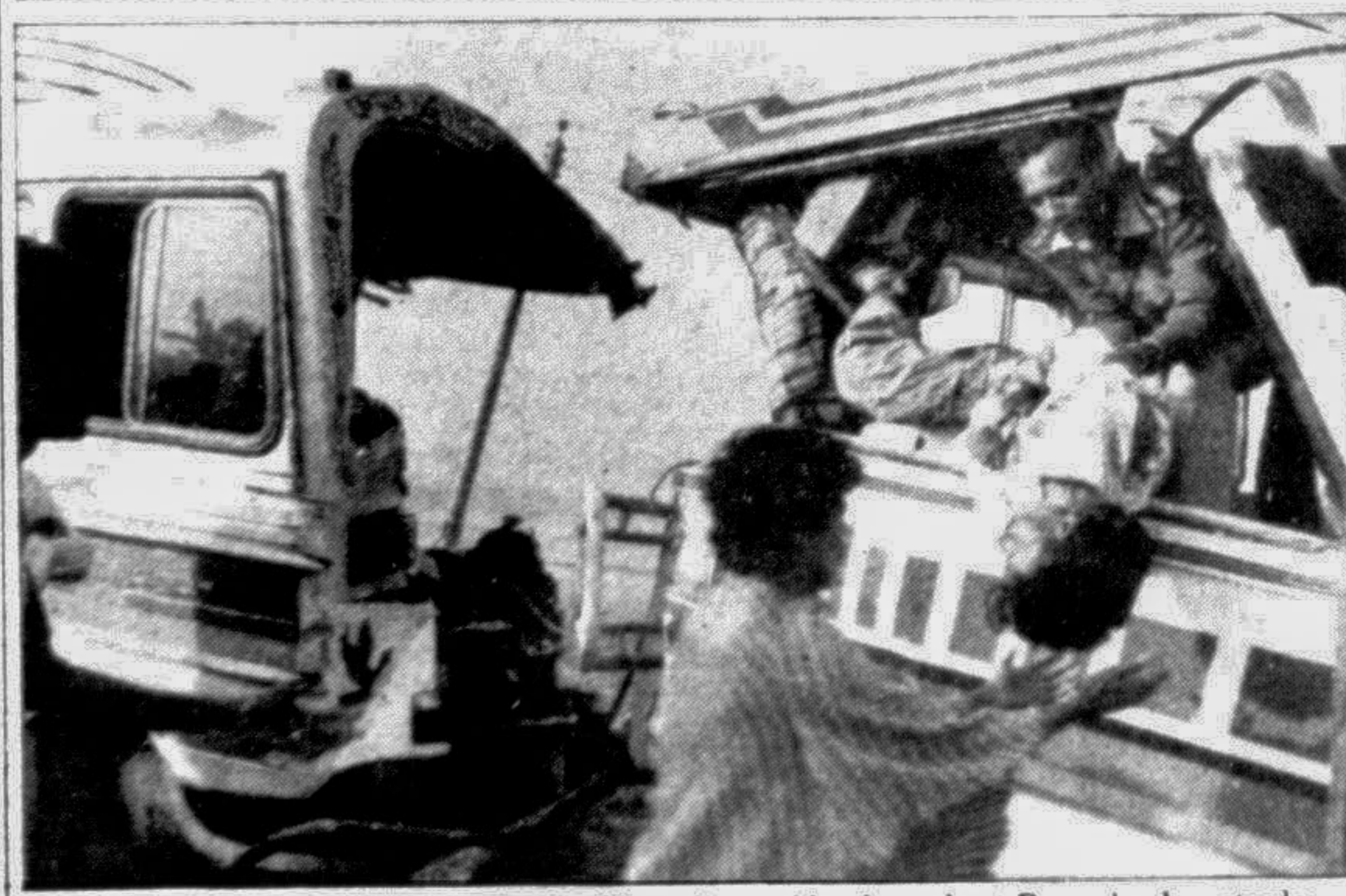
One of the accident victims being rescued by police and local people at Dewanbagh yesterday.