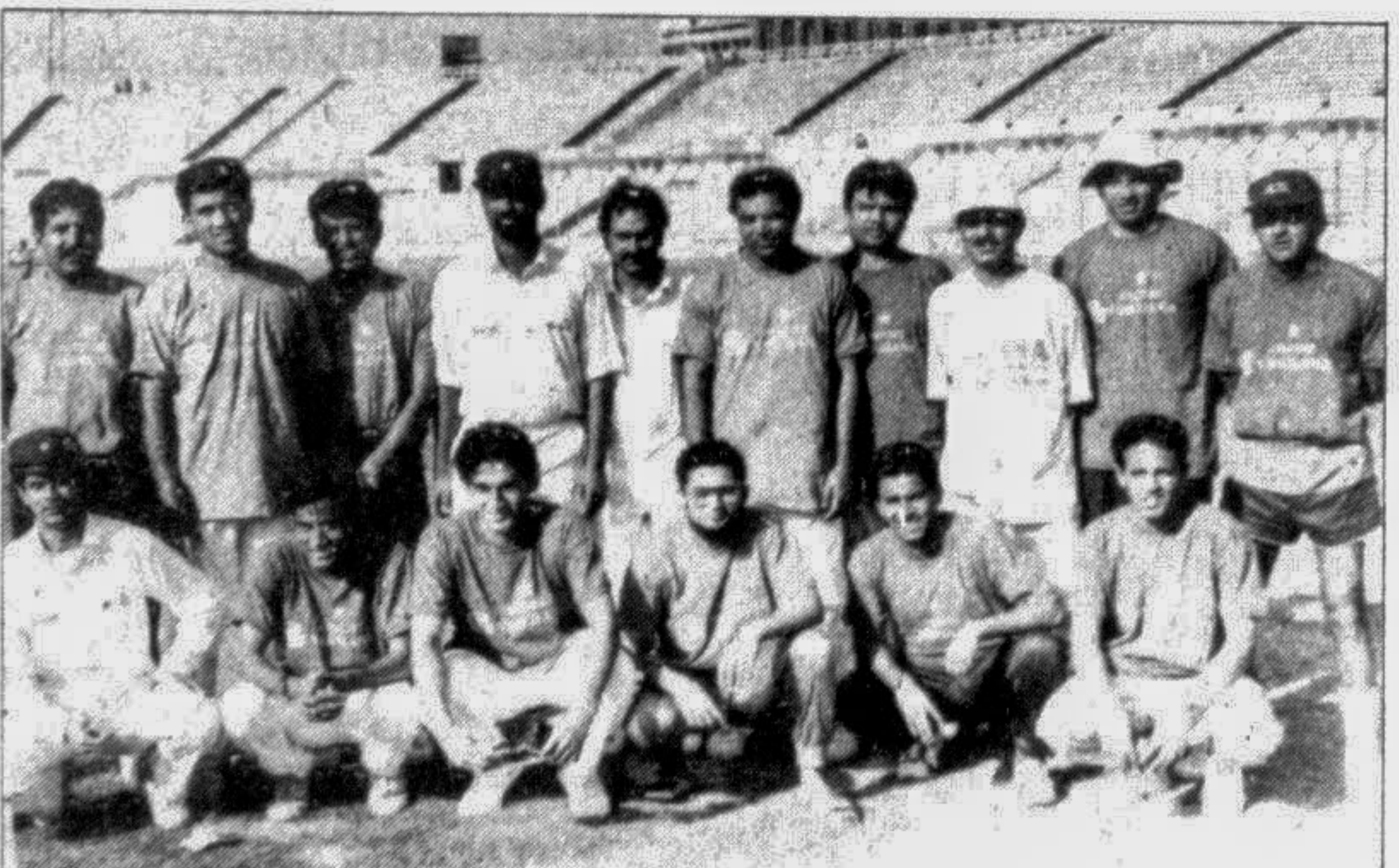
Players of the visiting Karachi Airport Gymkhana Club share a moment with the photographers just before the start of the exhibition match against Dhaka Premier Division league runners-up Dhaka Mohammedans at the Dhaka Stadium yesterday.

Ajax SC will take on Bangladesh Boys at the same venue on April 3.